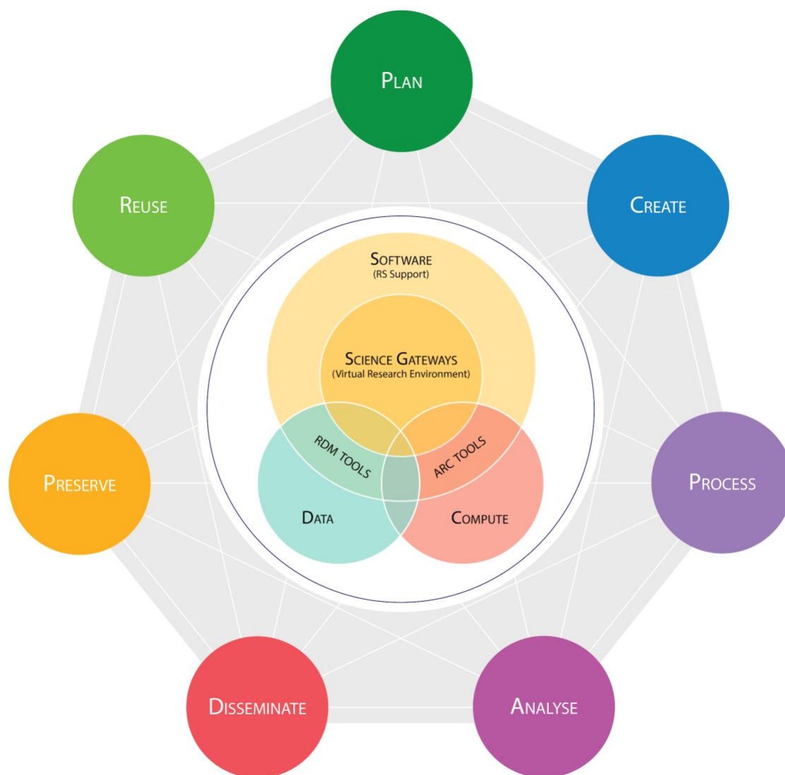
Figure 3: The research lifecycle and RS (see Appendix B and Appendix C ).

Interrelationships among Data, Compute and RS (inner circles) overlaying research lifecycle phases (outer circles). Users & Research Communities who are the agents that are engaged in the activities with RS are omitted in all these activities. Modified from the Data Management (DM) Position Paper: For Innovation, Science, and Economic Development Canada. Leadership Council for Digital Research Infrastructure (unpublished manuscript, August 31, 2017) and the Advanced Research Computing (ARC) Position Paper: For Innovation, Science, and Economic Development Canada. Leadership Council for Digital Research Infrastructure (unpublished manuscript, August 31, 2017).