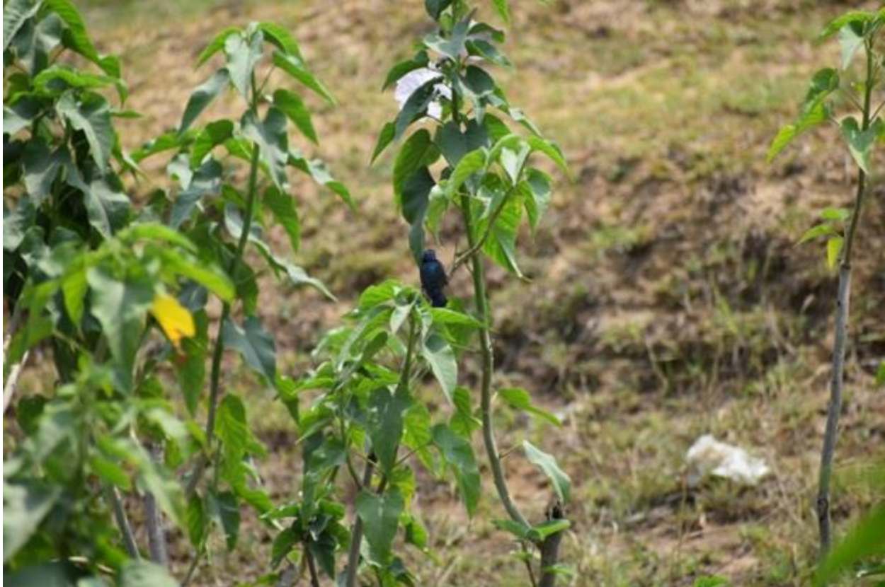
Plate 1: Purple Sunbird in Ipomoea carnea

From the above Table 1 , most of the nectar-feeding birds belong to the least concern category as per the International Union for Conservation of Nature (IUCN). There are some of the most common plant species where a variety of nectar-feeding birds are observed ( Plate 1 ). The flowers of these plants are vibrant in colour, which attracts these nectar-feeding birds. These plants have food and medicinal values too ( Kumar 2015; Kumar et al. 2018; Kanhar et al. 2020; Kumar et al. 2021; Das et al. 2022; Das 2023 ) but due to many anthropogenic activities, the population of these common plant species is now declining in many patches of the study area. Plantation of these plant species or conserving the existing species could be helpful in conserving not only nectar-feeding birds but also many other pollinators. Most of the nectar-feeding birds belong to the Dicruridae