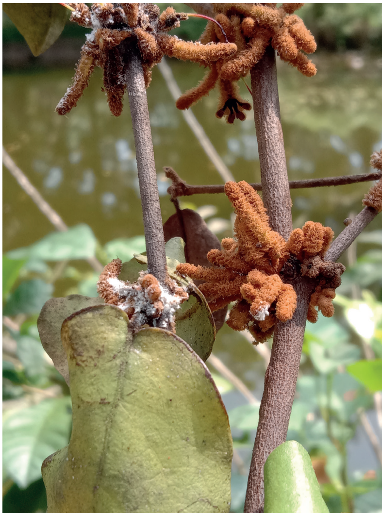
Figure 2. An aggregation of Chorizococcus ozeri Zarkani & Kaydan, sp. nov., on a semi-parasitic plant, Loranthus sp. (Loranthaceae), living on an avocado ( Persea americana Mill.), in Bengkulu Province, Sumatra (03°45'10"S, 102°16'59"E).

ringed with red ink on the coverslip. Paratypes. 3 ♀♀, INDONESIA: (AZ1205), same data as holotype; 3 ♀♀, AZ206, Sumatra, Bengkulu on semi-parasitic plant, Loranthus sp. (Loranthaceae), living on avocado ( Persea americana Mill.), 03°45'10"S, 102°16'59"E, 13.vii.2022, coll. A. Zarkani.