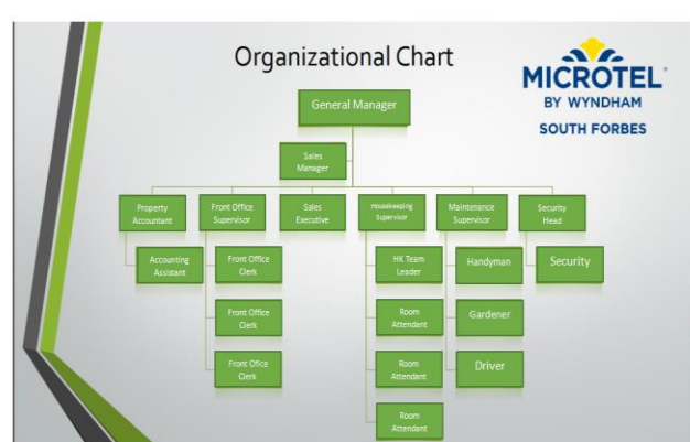
Figure 2. Organizational Structure of Microtel by Wyndham South Forbes

A skeleton force additionally keeps on working under the rules to support its occupants. Figure 2 shows the current organizational structure of Microtel South Forbes.