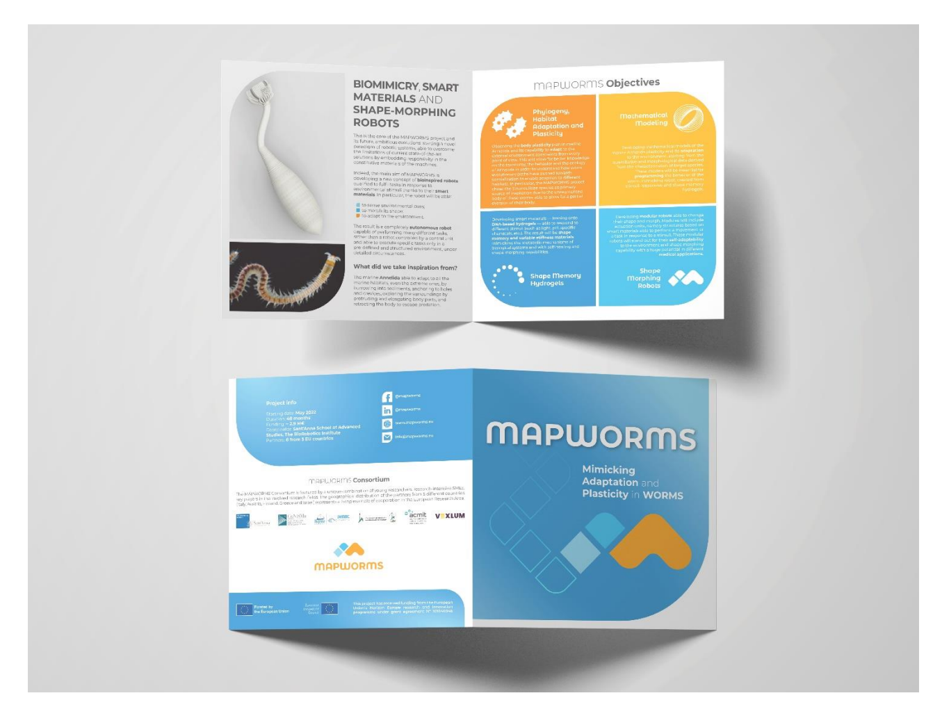
Figure 5 The MAPWORMS Leaflet

The official MAPWORMS leaflet, roll-up and public presentation were designed to provide a general and attractive overview of the project, the contact information, the website address, and social media links (see Figure 5). The leaflet is downloadable from the public website. They will be updated every 12 months.