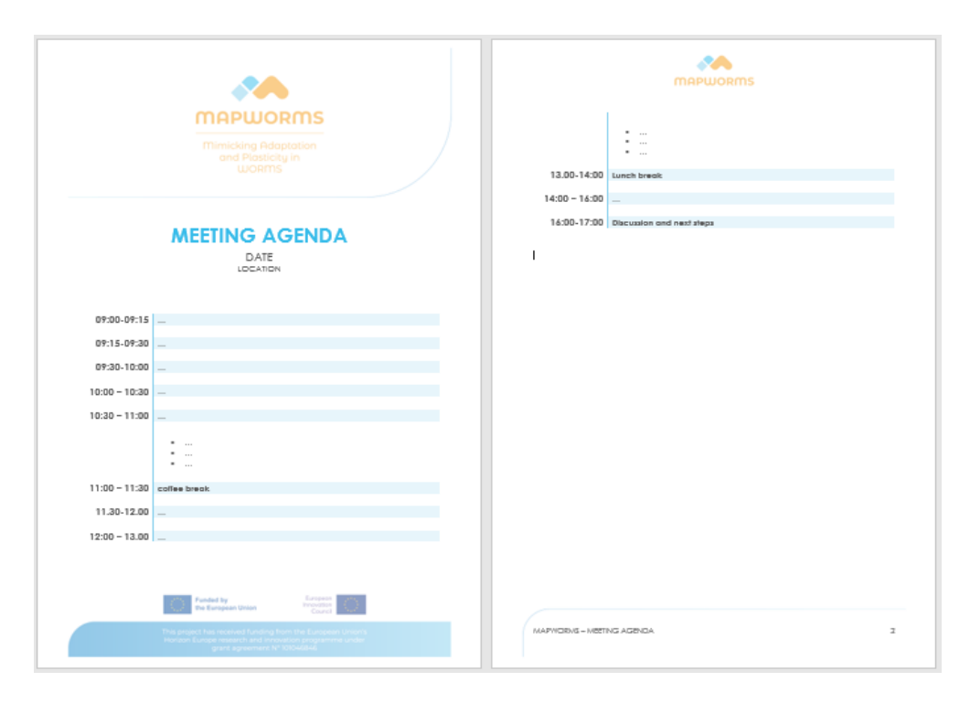
Figure 8 The MAPWORMS meeting agenda template