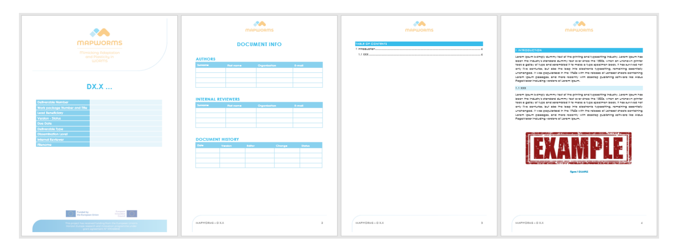
Figure 7 The MAPWORMS deliverable template

A template format for deliverables and meeting agenda were also developed and they are shown in Figure 7 and Figure 8.