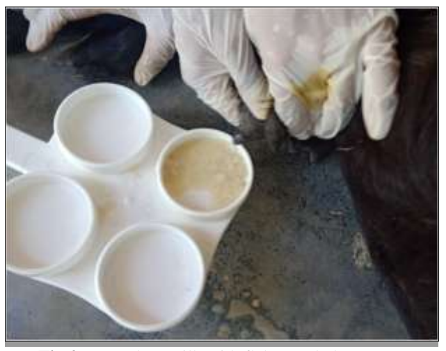
Fig 2: - Purulent milk with flakes and clots.