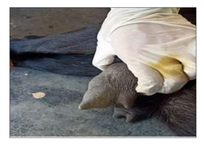
Fig 1: - Swollen right quarter of the doe.

A two-year-old doe (23 kg body weight) with supernumerary teats was presented to the Veterinary Clinical Complex, College of Veterinary Sciences and Animal Husbandry, CAU (I), Jalukie, Nagaland with the complaint of a swollen udder and reduced appetite. Clinical examination of the doe revealed a rectal temperature of 102.5 °F, swelling of the right quarter (Fig-1), warm and tender to touch. Further, fibrosed mass like hardness was felt upon palpation of the udder. Milk was purulent with the presence of clots and flakes (Fig-2). On the basis of history and clinical signs, it was tentatively diagnosed as a chronic clinical mastitis case.