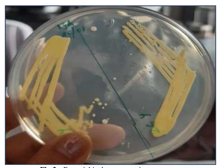
Fig 3:- Bacterial isolates on nutrient agar.

After overnight incubation at 37°C agar plate showed the presence of smooth, mucoid, and circular colonies (Fig-3). Gram's staining method revealed gram positive cocci arranged in the form of clusters under microscopic examination (Fig-4) to be grouped under Staphylococcus Spp.