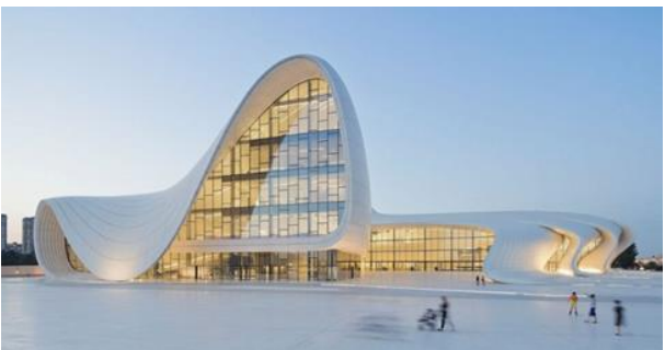
Figure 10. Heydar Aliyev Cultural Center in Baku. Zakha Khadid