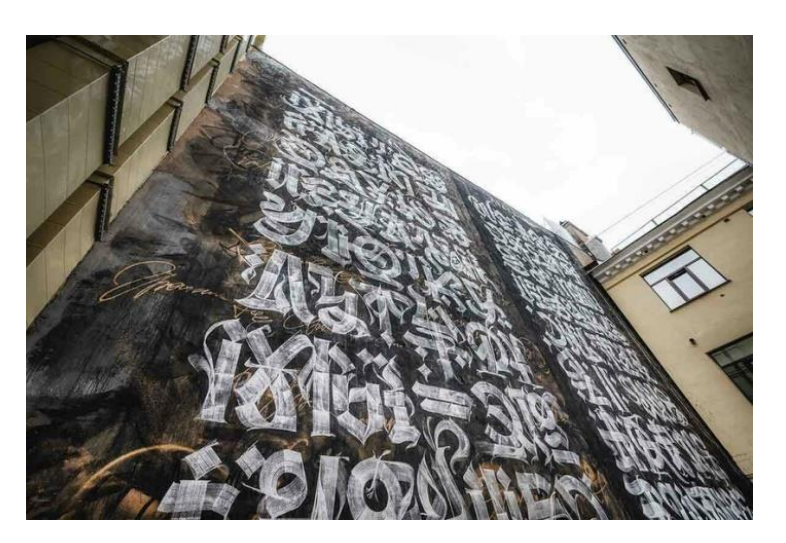
Figure 8. Dualism. St. Petersburg. Pokras Lampas