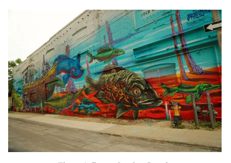
Figure 3. Bruno Smoky, Canada