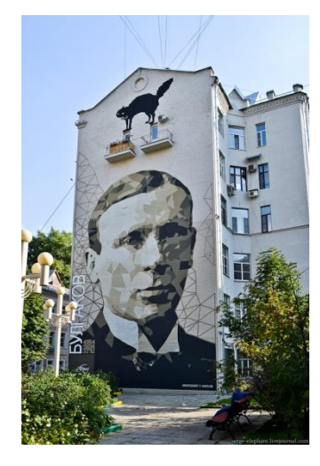
Figure 7. Zuk Club, M. Bulakov. Moscow.