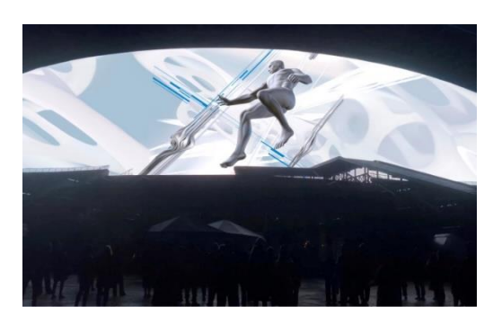
Figure 9. "Oscillation. Shards". Ak Bars Arena Stadium. NUR, International Media Art Festival, 2021 (Kazan). Meta Rite