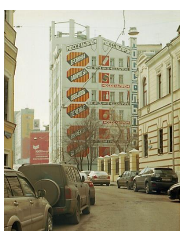
Figure 2. Advertising of Mosselprom. A. Rodchenko