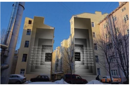
Figure 6. Super Square. St. Petersburg. A.V. Dobrodeev