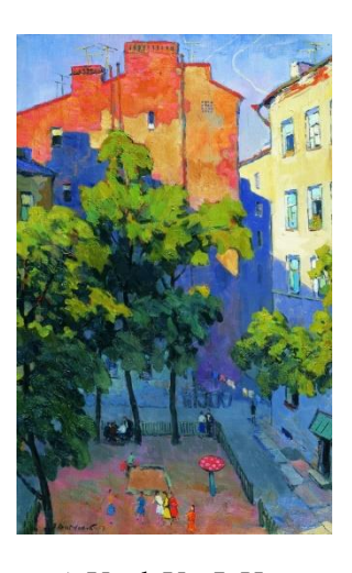
Figure 4. Yard. Ya. I. Krestovsky