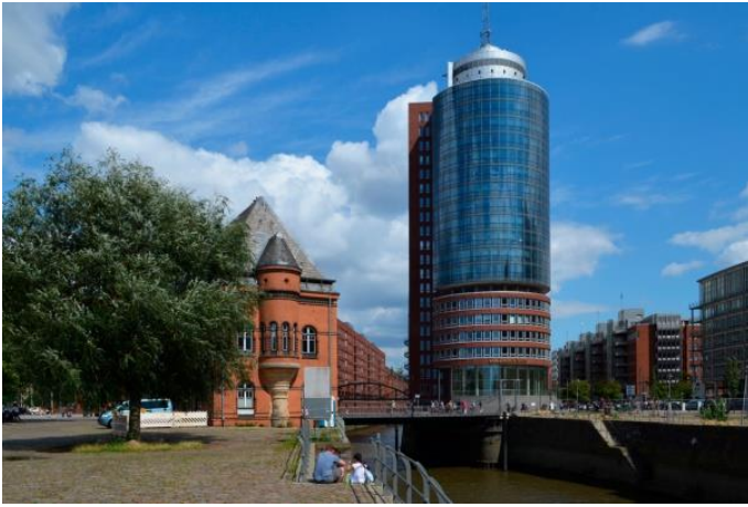
Figure 1. The building in Hamburg