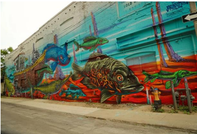
Figure 3. Bruno Smoky, Canada