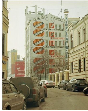
Figure 2. Advertising of Mosselprom. A. Rodchenko