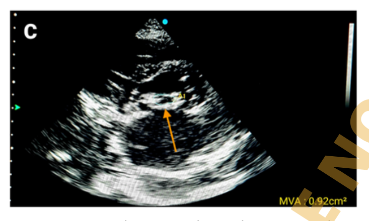
Fig. 3 (C) Transthoracic echocardiogram in short axis view showed a several mitral stenosis with a valve area of 0.9 cm2.