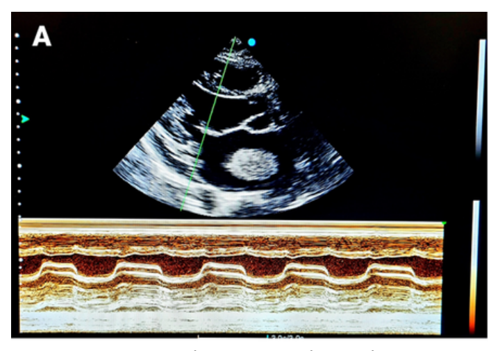
Fig.1 (A) Transthoracic echocardiogram in parasternal long axis view in diastole demonstrating the anterior mitral valve leaflet shows restricted posterior mitral valve leaflet, fusion of chordal and calcification.

After initial stabilization, the patient was treated with oral anticoagulant therapy and physical therapy which gradually improved his general condition. Although emergency surgery is usually indicated, the replacement of the mitral valve with removal of the ball-valve thrombus will be indicated 6 months later, due to insufficient technical resources.