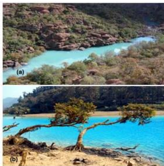
Figure 5: Two Turquoise Appearing Rivers as a Result of Anthropogenic Activities a- Wilge River, South Africa b- Lukha River (Wah Lukha), India

Wilge River is a tributary of Vaal River in the central South Africa. It originates near Leandra. It flows into the Bronkhorspruit River downstream of Bronkhorspruit town and drains the eastern part of the region (“Department of Water Affairs and Forestry”, South Africa, 2004). As a result of extensive coal mining and acid mine drainage (AMD), a turquoise or milky-blue colour was observed in the river in the month of June. The occurrence of milky-blue colour could be due to gypsum precipitation, which is a common by-product of lime neutralisation, and may originate from the Brugspruit Mine Water Treatment plant (Dabrowski et al. , 2013). It is also believed that the colour might be due to the precipitation of aluminium compounds as a result of neutralisation reactions in pH-neutral waters (McCarthy and Pretorius, 2009). However, the actual mechanism behind the coloration in the river remains unknown.