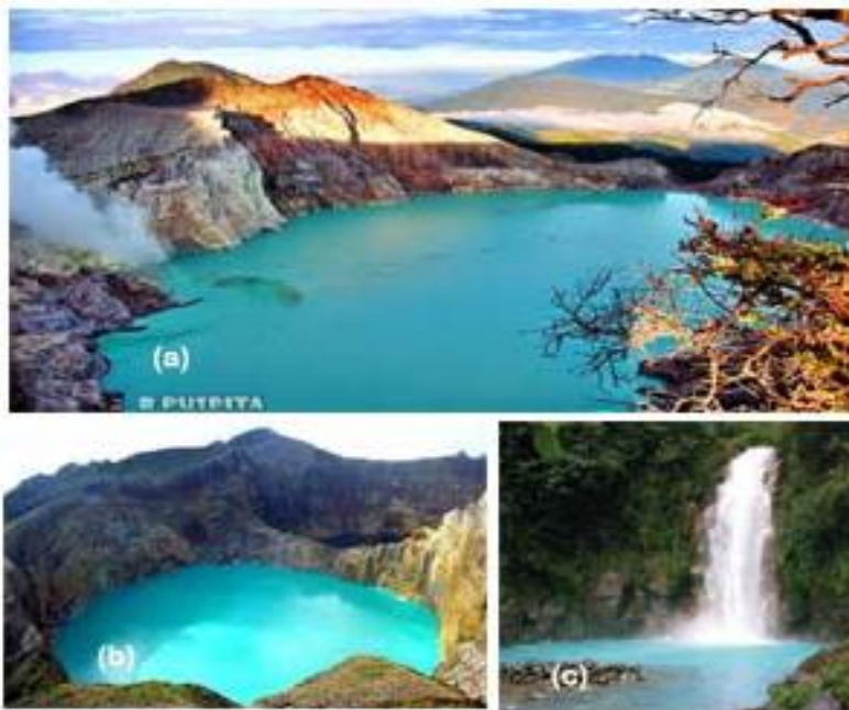
Figure 3: Different Volcanic Area Turquoise Freshwater Bodies a- Kawah Ijen, Indonesia b- Kawah Kelimutu, Indonesia c- Rio Celeste, Costa Rica