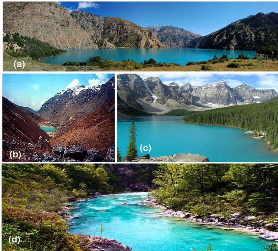
Figure 2: Different Glacial-Fed Turquoise Freshwater Bodies a- Phoksundo Lake, Nepal (source: www.wikipedia.org ) b- Lake Samiti, India (source: www.questhimalaya.com ) c- Moraine Lake, Canada (source: www.wikipedia.org ) d- Soča River, Slovenia (source: www.feel-planet.com )

Lake Pukaki is one of the three lakes situated in the Aoraki Mount Cook National Park. It is a glacial-fed lake (Irwin, 1978). The lake is very famous for its stunning turquoise appearance (Thompson-Carr, 2012). The turquoise appearance of lake is due to the finely-ground glacial flour (Gallegos et al. , 2008).