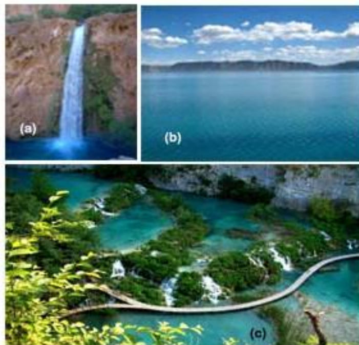
Figure 4: Different Calcium Carbonate Rich Turquoise Freshwater Bodies a- Havasu Creek, Grand Canyon b- Bear Lake, Utah c- Plitvice Lakes, Republic of Croatia

surface, thus, giving the lake its intense turquoise-blue color. It is because of this color, the lake is also known as the “Caribbean of Rockies” (Davis and Milligan, 2011).