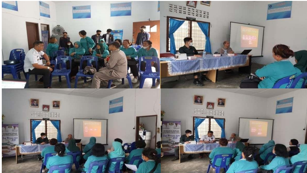
Figure 2. Community Service Activities

In addition to communication, teamwork is considered important because the benefits and functions of the Team are that it can change attitudes, and behaviors, share knowledge, increase solidarity and strengthen the relationship between the values of Unity in Diversity in an organization in achieving common goals. A team will be more effective when compared to working alone. In a team, it is not only cooperation but also a unit that mutually influences one another so that work can be completed easily and quickly. To work effectively, a team requires three different types of skills. First, the Team needs people with technical expertise. Second, it needs people with problem-solving and decision-making skills to be able to identify problems, generate alternatives, and evaluate alternatives, The close relationship between trust and involvement of Posyandu cadres is considered important to build a solid team [20]. Where the more posyandu cadres believe in management, they will be more involved and productive, and vice versa. Teamwork is most likely to thrive when leaders create a sporting environment. Supportive action helps the group take the first steps needed to foster teamwork [21].