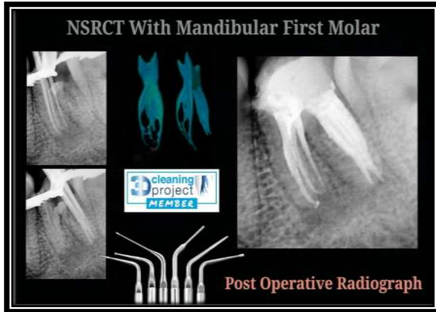
Fig 9:- Post operative View.