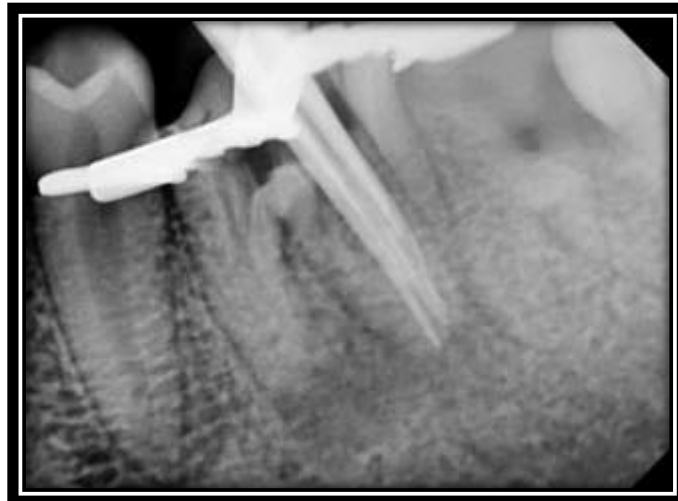
Fig 7:- Fourth canal of distal root.