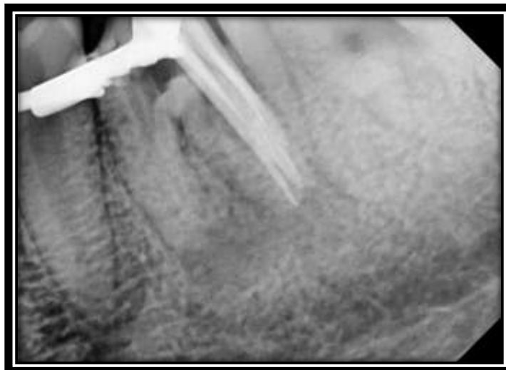
Fig 8:- Fifth canal of distal root.