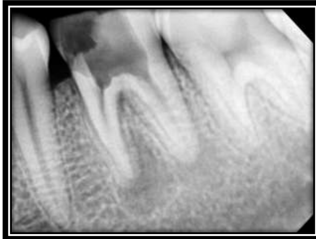
Fig 1:- Post OperativeView.

Inferior alveolar nerve block was administered using 2% Lignocaine with 1 : 80,000 epinephrine (Indoco Remedies Ltd., Mumbai, India) followed by isolation of tooth using rubber dam .Prior to treatment, radiographs of the tooth revealed an apical periodontitis (Figure 1(a)) .After removal of the temporary restoration, four canal orifices (mesiobuccal,mesiolingual, distobuccal and distolingual) were visible initially. Other orifices were located using DG16 and Champagne bubble test .Exploration was carried out along the isthmus extending between and beyond the distolingual and distobuccal canals. Two further canals were discovered, one buccal and one lingual to the previously considered distobuccal canal. The case was done under magnification .Hence, a total of 8 canal orifices were located with three in mesial root and five in distal root. Post obturation patient was asymptomatic and even after one month follow-up.