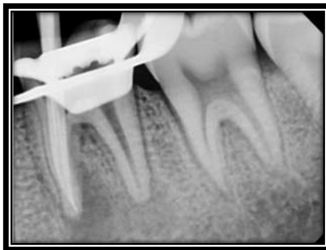
Fig 2:- With three canals in mesial root.