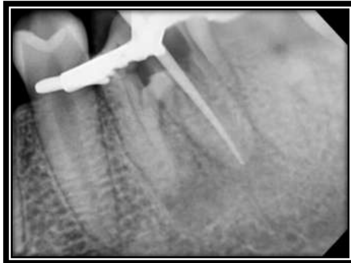
Fig 4:- First canal of distal root.