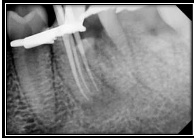
Fig 3:- Mesial Angulation View with three canals in mesial root.