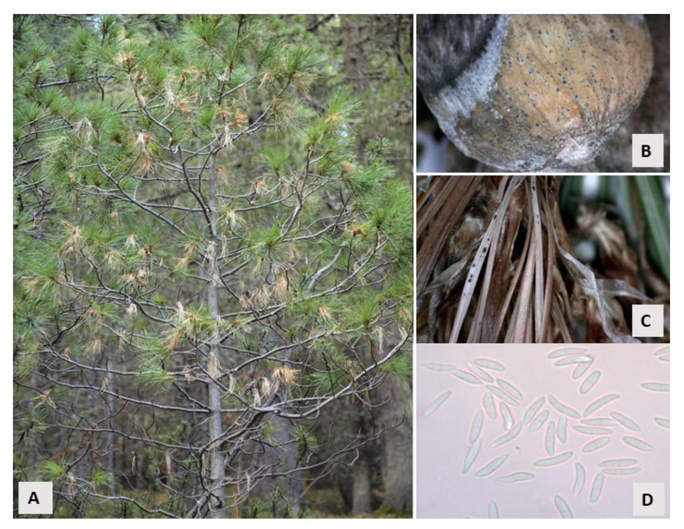
Fig. 2. Sirococcus conigenus on Pinus peuce: A – typical symptoms of shoot blight disease; B – pycnidia on cone scales; C – pycnidia on needles; D – conidia.

Margarita Georgieva, Georgi Georgiev, Plamen Mirchev, Sevdalin Belilov