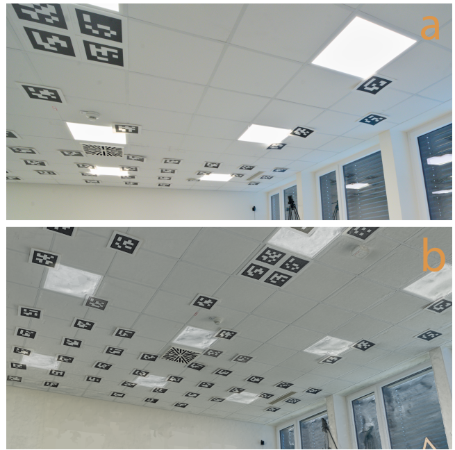
Figure 5: (a) A sample photo, taken by the Photogrammabot from the room for photogrammetry. (b) The rendered result of photogrammetry of the same room.

saving many hours of human work time per scan in many situations. Furthermore, it is far more energy-efficient for remote sites to ship a comparatively small robot that needs no special training for starting the operation than have human photographers travel by plane to the target site.