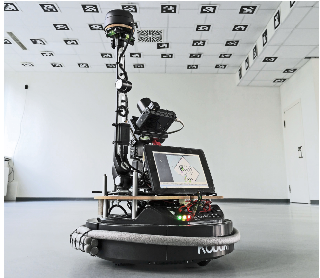
Figure 1: Photogrammabot in action capturing photos of an indoor environment for 3D reconstruction using photogrammetry.

The term Mixed Reality (MR) describes "a particular subclass of VR related technologies that involve the merging of real and virtual worlds" [21] including consistent visual presentation to a user through an appropriate display device. At the same time, there can be interactions between the virtually presented objects, the actual objects, and the user. One of the main technical challenges in Mixed Reality (MR) is for a system to know the geometry of the physical world relative to the position of the display system [8]. In addition to that, creating high-quality content for MR, which visually blends well with the actual environment, is burdensome and requires considerable effort. Photogrammetry [20] can aid these goals by precisely reconstructing textured 3D models of environments and