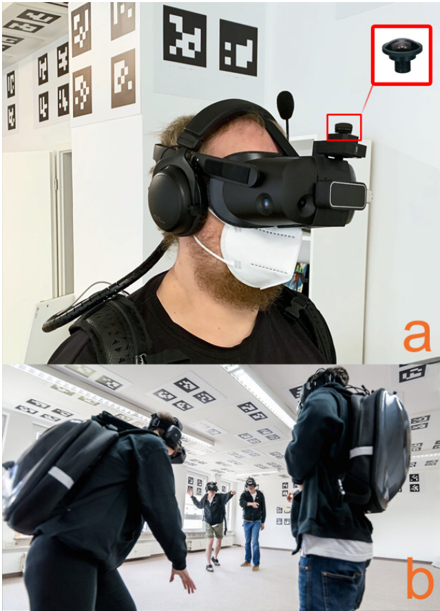
Figure 2: Immersive Deck™ [23]. (a) An immersed user localized using the upward-directed camera having a fisheye lens mounted on the HMD. The location of the user is determined using the current view of the camera of the fiducial markers on the ceiling compared to the marker map obtained from the 3D reconstructed model. (b) Multiple immersed users in group walkable-VR while being localized using Immersive Deck™ system.

ready-to-use libraries and tools to control diverse types of robots while being able to run on an IoT computer such as Raspberry Pi (RPi) [25].