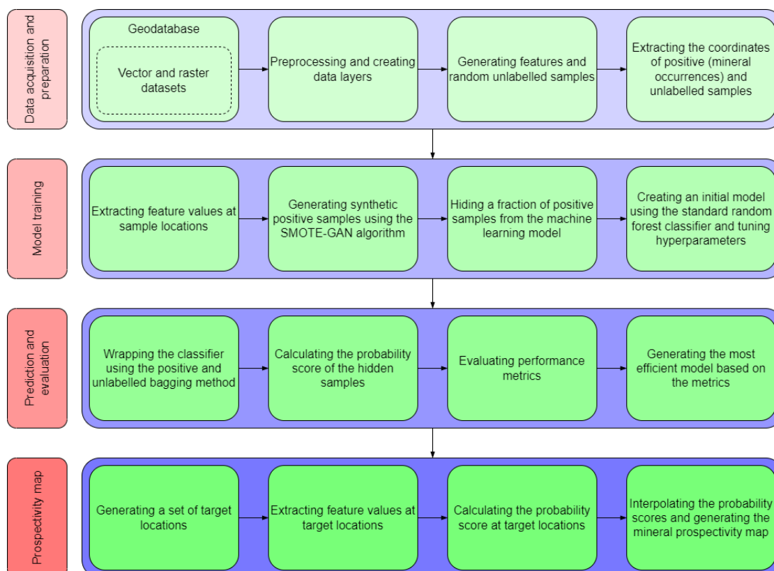
Figure 1. Proposed machine learning-based framework for mapping prospective zones of critical minerals.