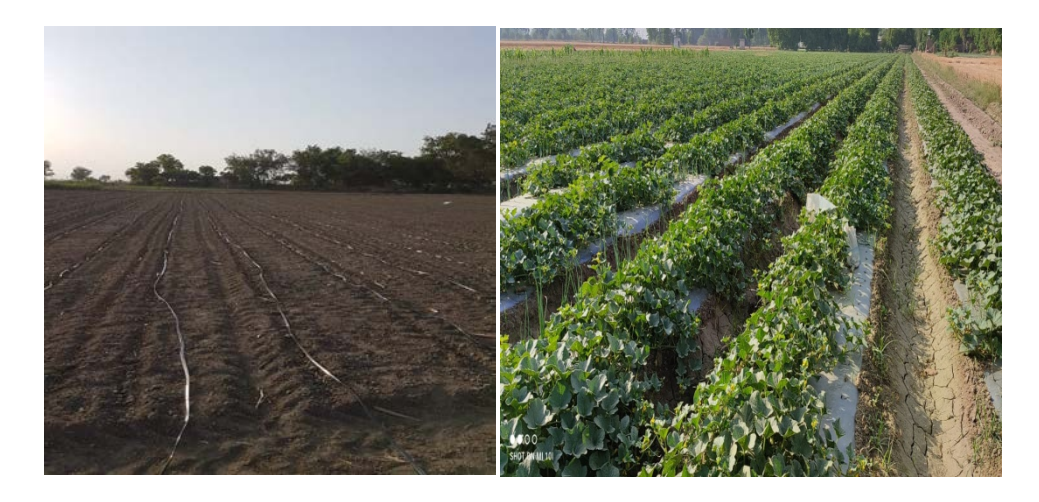
Fig 4. For cultivation of vegetables, drip Irrigation method adopted by Farmer, District Faridkot, Punjab.