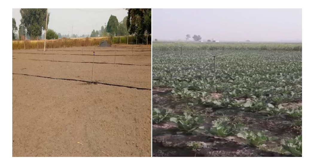
Fig 5. For cultivation of vegetables, sprinkler Irrigation method adopted by Farmer, District Faridkot, Punjab.