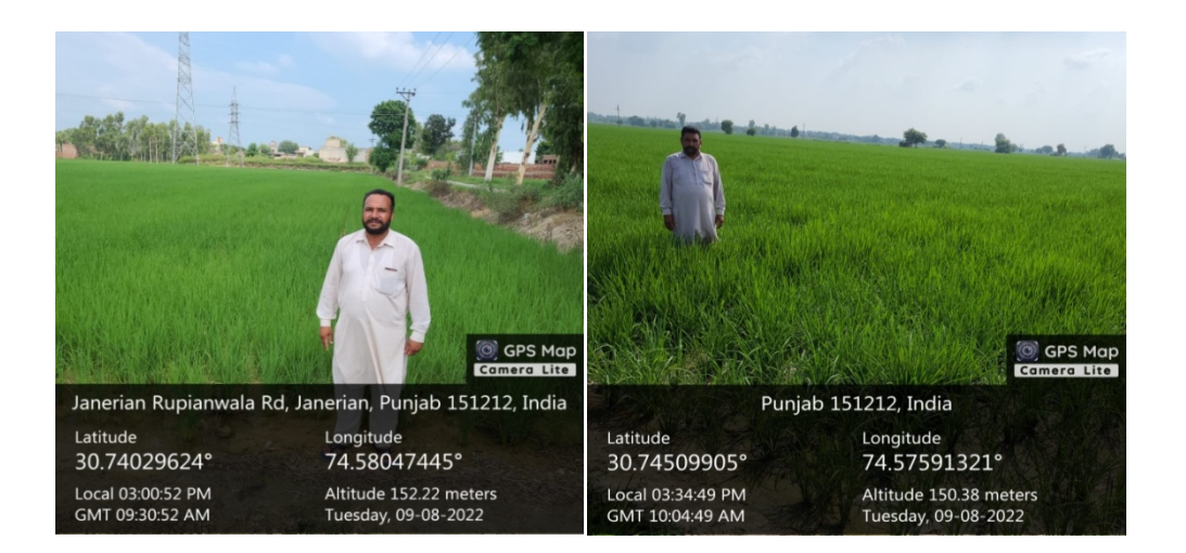
Fig 3. DSR (Direct seeded rice) cultivation by farmers, District Faridkot, Punjab.

4th AEGC: Geoscience – Breaking New Ground – 13-18 March 2023, Brisbane, Australia