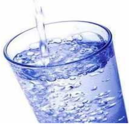
Figure 1. Water purity.

Approximately 70% of the human body consists of water. Therefore, living and dead waters are used in the treatment of various diseases. It is mainly used to clean the organs performing the cleaning function (Kidney, liver, intestine). In addition, it is used in the treatment of colds, Angina, flu. It is also used in the treatment of skin burns, suppuration and other skin diseases. Living and dead water is also used in cosmetics to protect hair from shedding, and to clean the skin of the face. There are several technologies of purification in the production of drinking water. For example, water taken from underground is first distilled, that is, it turns into dead water. Then it is saturated with useful micro and macro fertilizers. In another technology, water taken from underground is first filtered, then disinfected and ozonized using ultraviolet rays. Nowadays, great attention is paid to the purity of water (Figure 1-2).