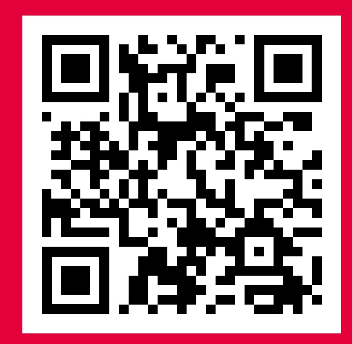
Download the full paper (preprint version)

They bring new possibilities, but also new requirements.