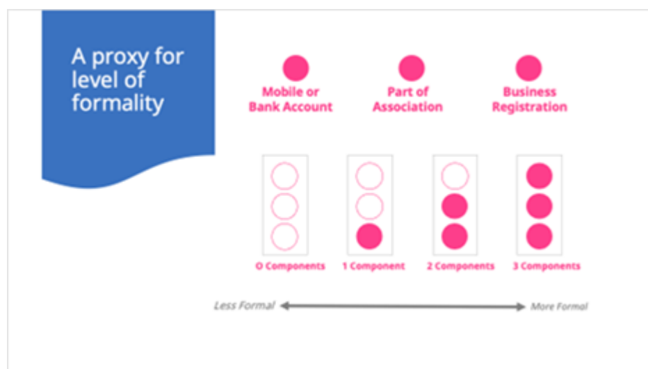
Figure 1. Modeling informality as a vector of characteristics

Only 63 respondents report their businesses as fully formalized. Of the rest, 277 are completely informal, with the remaining ones at levels of formality 1 and 2. This indicator varies across countries. Completely informal businesses are over 80% in Syria, and under 10% in Bangladesh, Ecuador, and Morocco (Table 1).