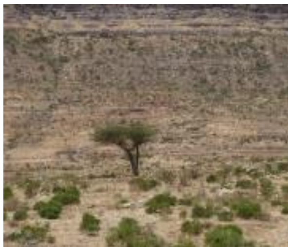
Momona at May Shewate, Hech'i, Tigray (2005).

Growing Faidherbia albida in Belgium would be impossible in full ground; it would require a large greenhouse. In our garden, we substituted it with another leguminous tree, Robinia pseudoacacia , popularly called “acacia”, which sheds its leaves in winter and which allows pruning to obtain a typical acacia savannah tree shape. Both species are thorny. The robinia was obtained from the Amazonia plant shop in Rocourt (Belgium) around 2010.