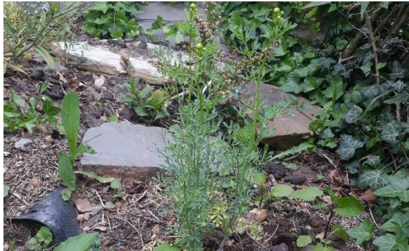
Herb-of-grace in the Tigray garden (Belgium) (May 2023)

In Tigrinya : ጩና ኣዳም [ch'enna-addam] (November et al., 2002).