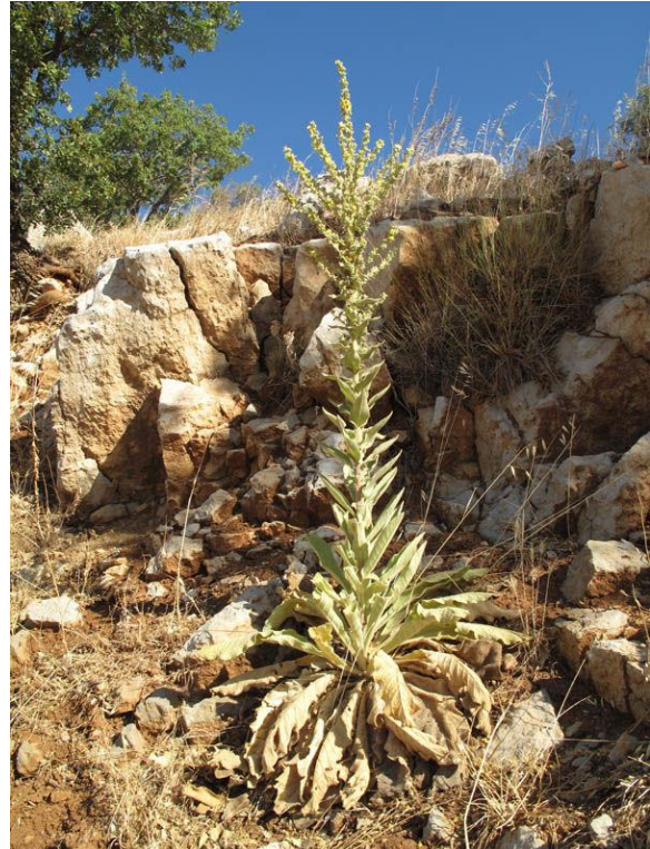
Verbascum sinaiticum on Mt. Hermon (Lebanon)

Plants purchased from Willemse nursery (France) through mail order in 2023. Perennial plant. Seeds are mainly dispersed by the fur of larger mammals. Little chance for dispersion in Belgium, the only roaming larger mammals in this area are cats and foxes.