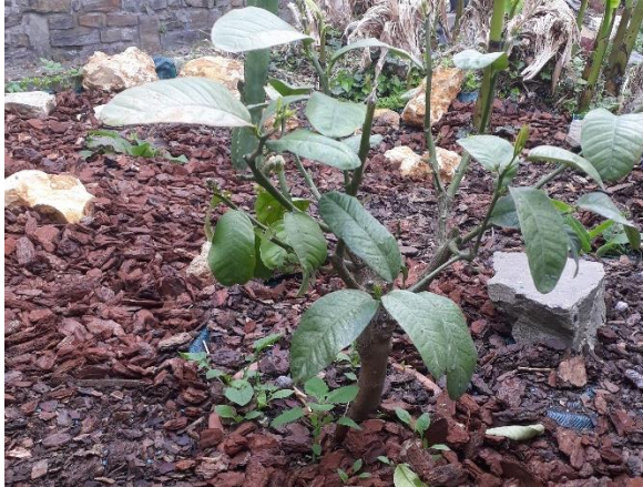
Citrus medica in the Tigray garden (Belgium) (May 2023)