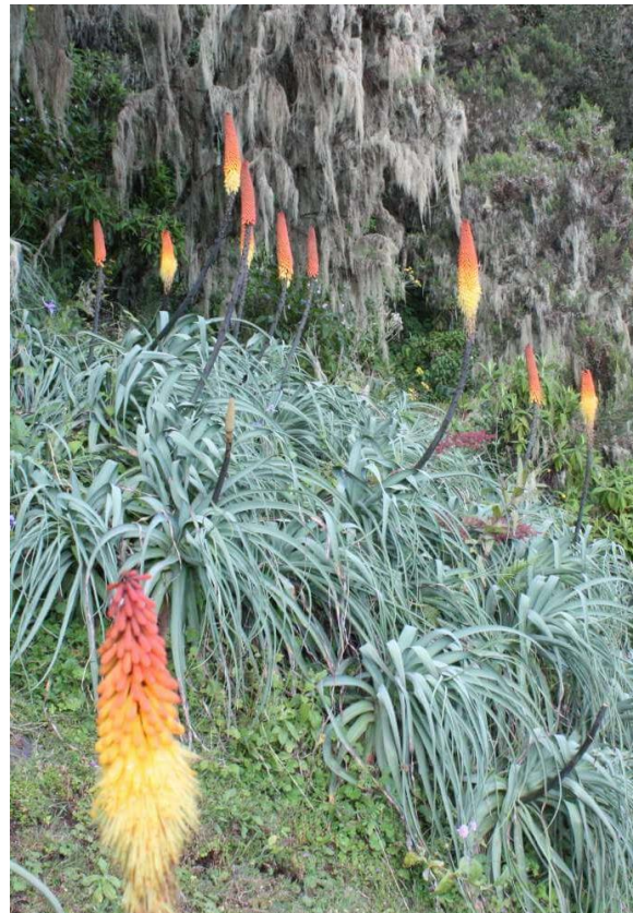
Ashenda along the Rift Valley escarpment

Plants purchased from Esveld nursery (The Netherlands) through mail order. Reputedly grows in full ground in the Belgian climate with vegetative reproduction.