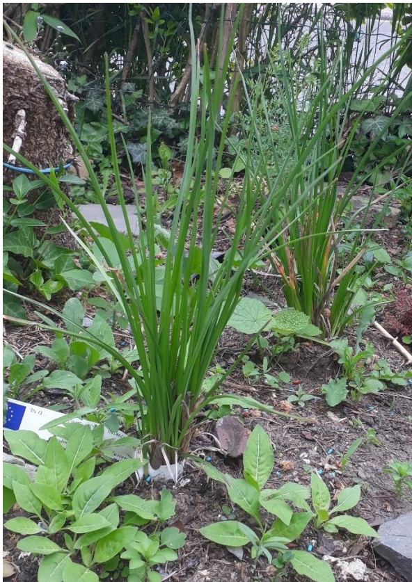
Substituted by Kniphofia 'Papaya Popsicle' in the Tigray garden (Belgium) (May 2023)