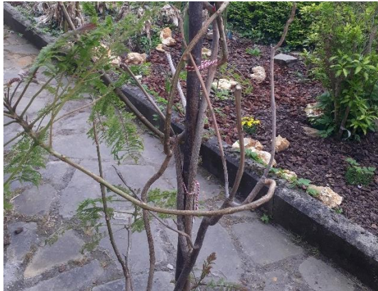
Jacaranda in the Tigray garden (Belgium) (May 2023)