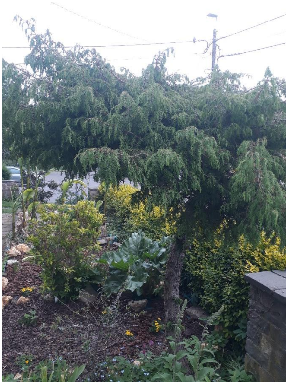
Substituted by the winterhard Juniperus communis in the Tigray garden (Belgium) (May 2023)