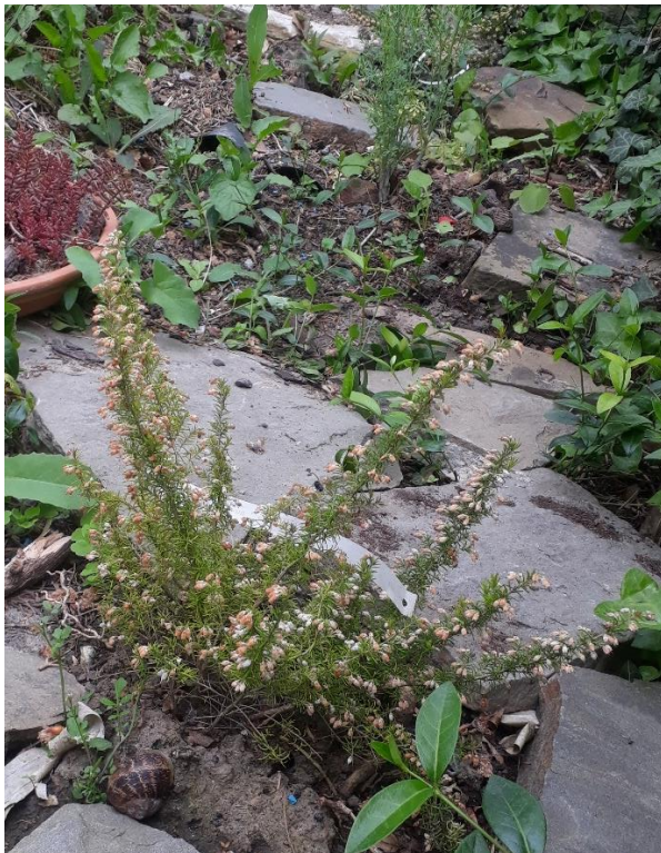
Tree heath in the Tigray garden (Belgium) (May 2023)

In Tigrinya : ሻቅቶ [shaqto], ሓስቲ [hasti] (November et al., 2002).