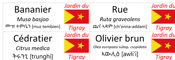
Sample of species labels in the Tigray garden, represented at scale 1/3

As the garden is visible to the general public, plant labels are produced in the local French language, with scientific and Tigrinya names written in tiny font.