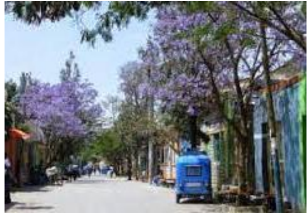
Jacaranda trees in a street of Mekelle

Tree purchased from a nursery in Mekelle (Tigray) around 2015. Permanently grown in pot, and transferred to a frost-free environment from 1 November till the beginning of May. We managed to obtain lush vegetative growth but no flowers, so far.