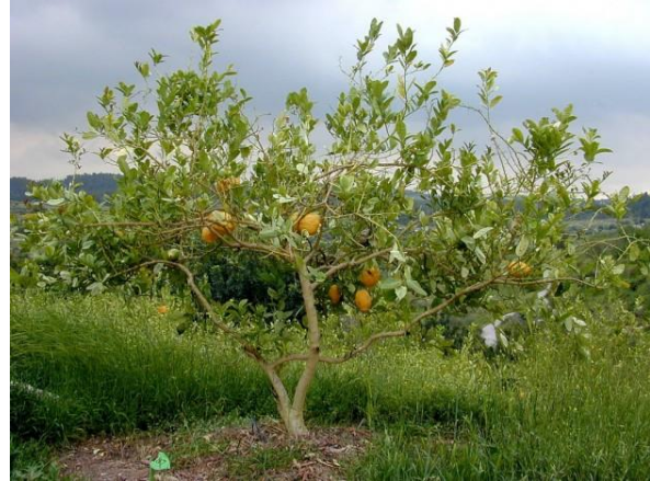
Citrus medica tree in Israel, where it is called “etrog”

Tree purchased from Plantencentrum Exotica (Belgium) through mail order. Grown in pot, and transferred to frost-free environment from 1 November till the end of April.