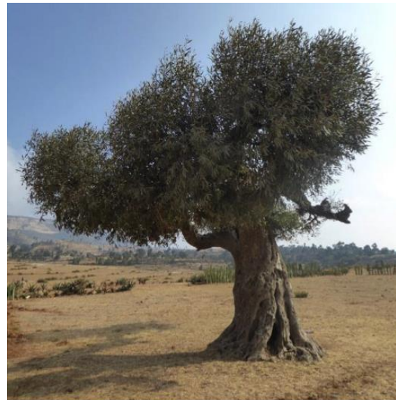
African wild olive tree near the edge of Des'a forest in Tigray

Tree obtained from the May Zahla nursery in Dingilet (Tigray). Grown in pot, and transferred to frost-free environment from 1 November till the end of April. The tree sheds nearly all its leaves in winter, presumably due to poor light conditions.