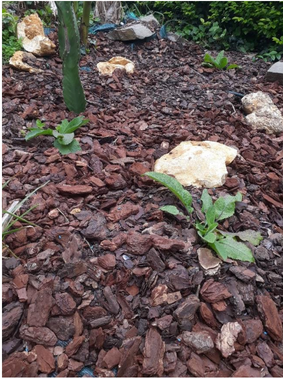
Substituted by Verbascum nigrum in the Tigray garden (Belgium) (May 2023)

In Tigrinya : ትርናኻ, ጥርናቕ [tirnakha, t'irnaqa] (November et al., 2002), ሓንደጋ [handega] (Teklay et al., 2013).