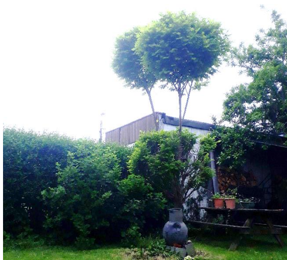
Robinia pseudoacacia as a substitute for momona in the Tigray garden (Belgium) <date>