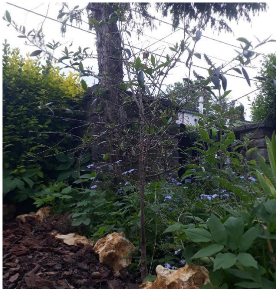
African wild olive in the Tigray garden (Belgium) (May 2023)