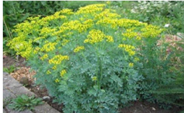
Herb of grace in Mekelle (Tigray) (Teklit Gebregiorgis, 2015)

Plant obtained from a hobby gardener in Liège (Belgium) in 2023. Grows in full ground; winterhard.