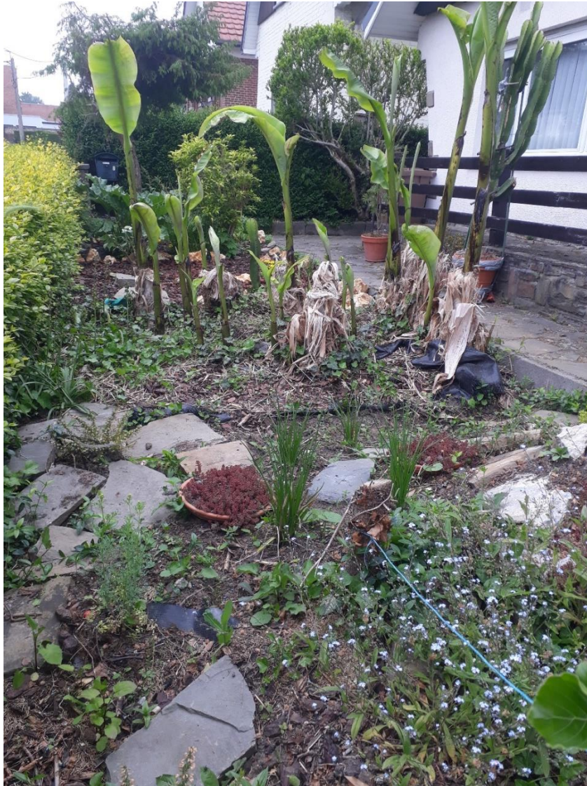
View on the Tigray Garden on 22 May 2023.

As the garden is visible to the general public, plant labels are produced in the local French language, with scientific and Tigrinya names written in tiny font.