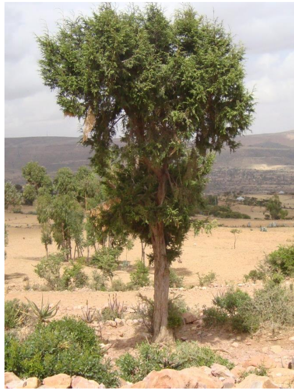
Juniperus procera (Awulo, Tigray, 2023)

Juniperus communis obtained from a nursery in Belgium, and planted around the year 2000.