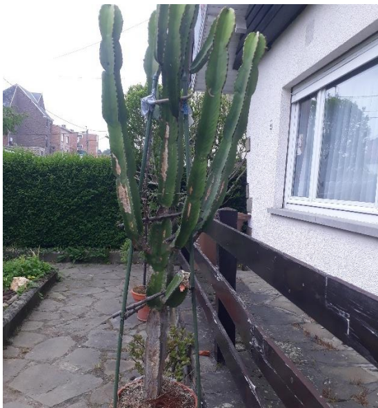
Euphorbia candelabra in the Tigray garden (Belgium) (May 2023)

In Tigrinya : ቁልቁል [qwolqwal] ; as the plant produces latex when damaged, it is also called “qwolqwal demay”, where "demay" means 'bleeding'.