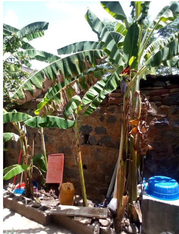
Tembien banana (Abiy Addi, Tigray, 2023)

Shoots obtained in 1992 from a hobby gardener in Liège (Belgium). Grown in pot until 1995. Planted in full ground in 1996. Every winter the foot is covered with decayed leaves and straw. Re-emerges in spring and produces small fruits by August-September. Vegetative multiplication.