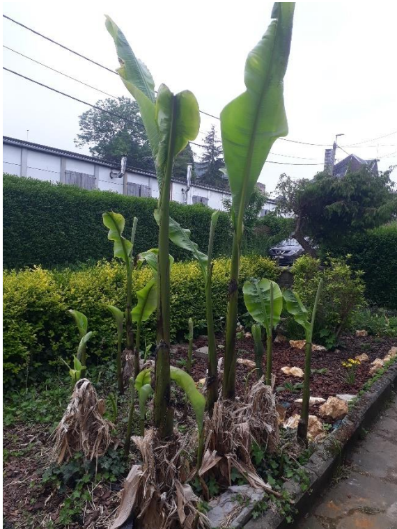
The Tigrayan “local banana” plants were substituted by the winterhard M. basjoo in the Tigray Garden (Belgium) (May 2023)