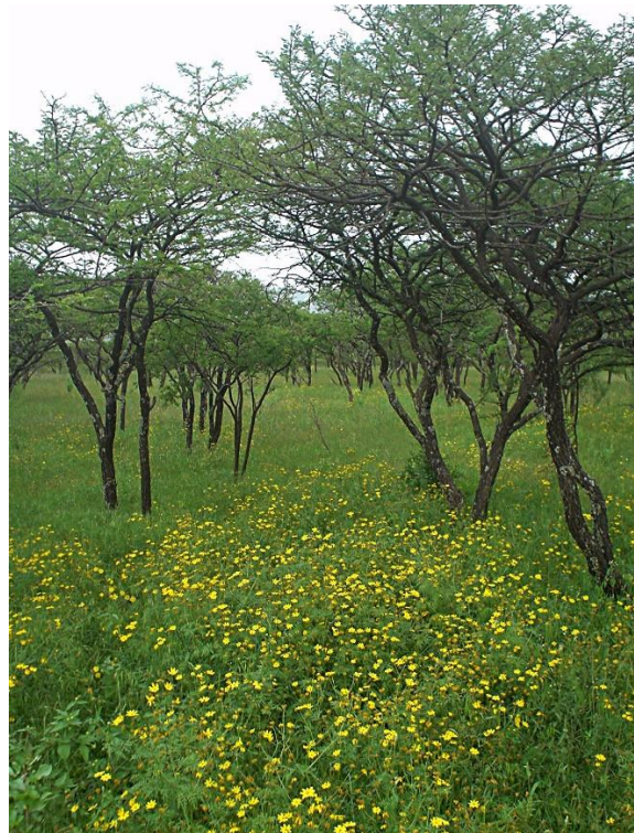
Typical growth of Bidens macroptera under an Acacia cover in Tigray in September (Miheni enclosure) (Aerts, 2019)

Plants purchased in 2023 from Home Meets Nature (The Netherlands) through mail order. Annual plant, may disperse its seeds.