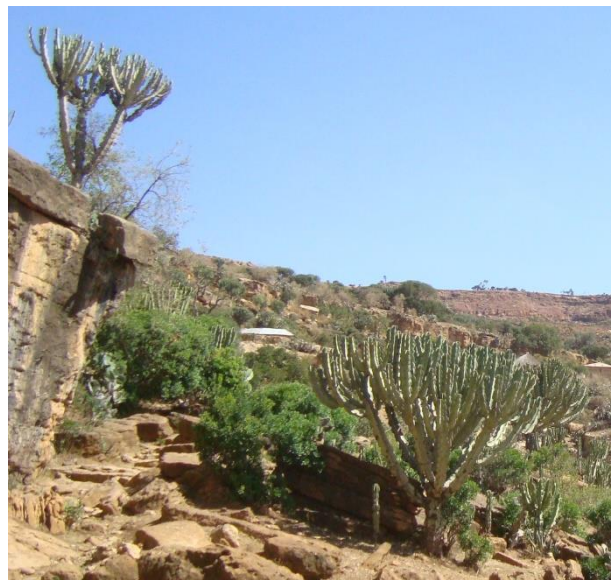
Euphorbia candelabra near Abune Ayezgi church in Haddinet (Dogu'a Tembien, Tigray, 2017).

A branch was taken from a tree in Addi Qoylo (Tigray) and potted around 2014. Vegetative multiplication. Grown in pot, and transferred to a frost-free environment from 1 November till the beginning of May.