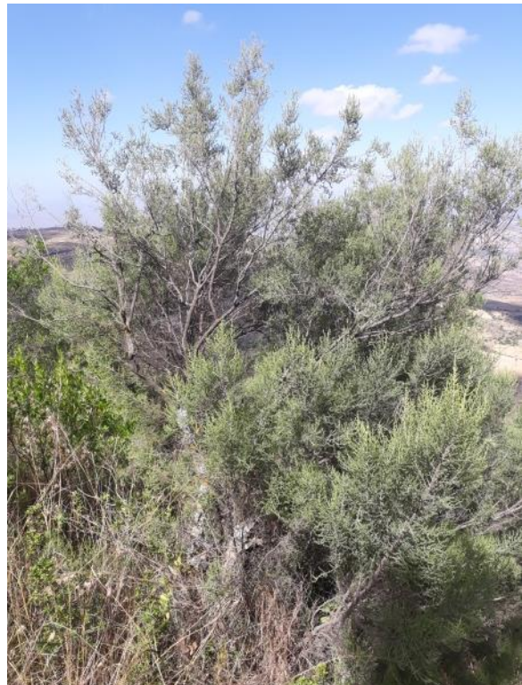
Tree heath on Dabba Selama mountain at 2646 m, Dogu'a Tembien, Tigray

Plants purchased from Esveld nursery (The Netherlands) through mail order in 2023. Reputedly grows in full ground without reproduction. Said to reach up to 2 m high in the Belgian climate. The planted variety is expected to be of Mediterranean origin and may have characteristics that are slightly different from the Tigrayan variety (McGuire and Kron, 2005). It resists frost up to minus 10°C (successful stress test at -6°C in 2023).