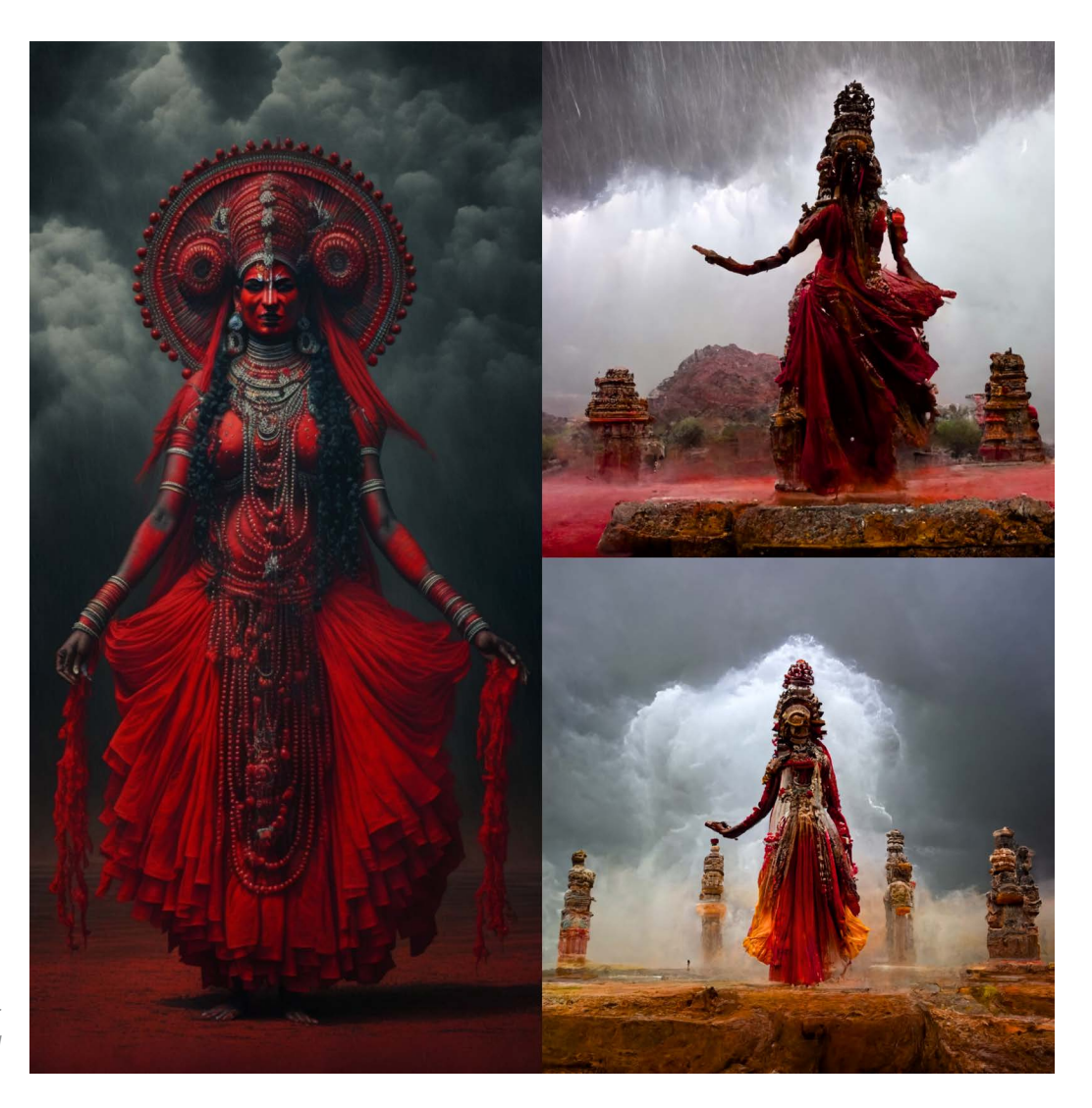
Figure 1. Al rendered sketches for Seven Acts of Nature's Devastating Dance (2023), by Kinnari Saraiya.

With the advent of climate change hanging in the air like a storm filled sky, the deeply connected way that each thing in the Every is entangled between and across everything else in materially specific ways is becoming accepted within popular culture. And, these ever mutable intra-actions, also reconfigure the very arrangement of entanglements of things — like the binding knots of the Inca quipus . The embedding of a circle in 3-dimensional space, like the Temple pillars in Indian artist Kinnari Saraiya's nature goddess worlds is a knot. Complex shapes