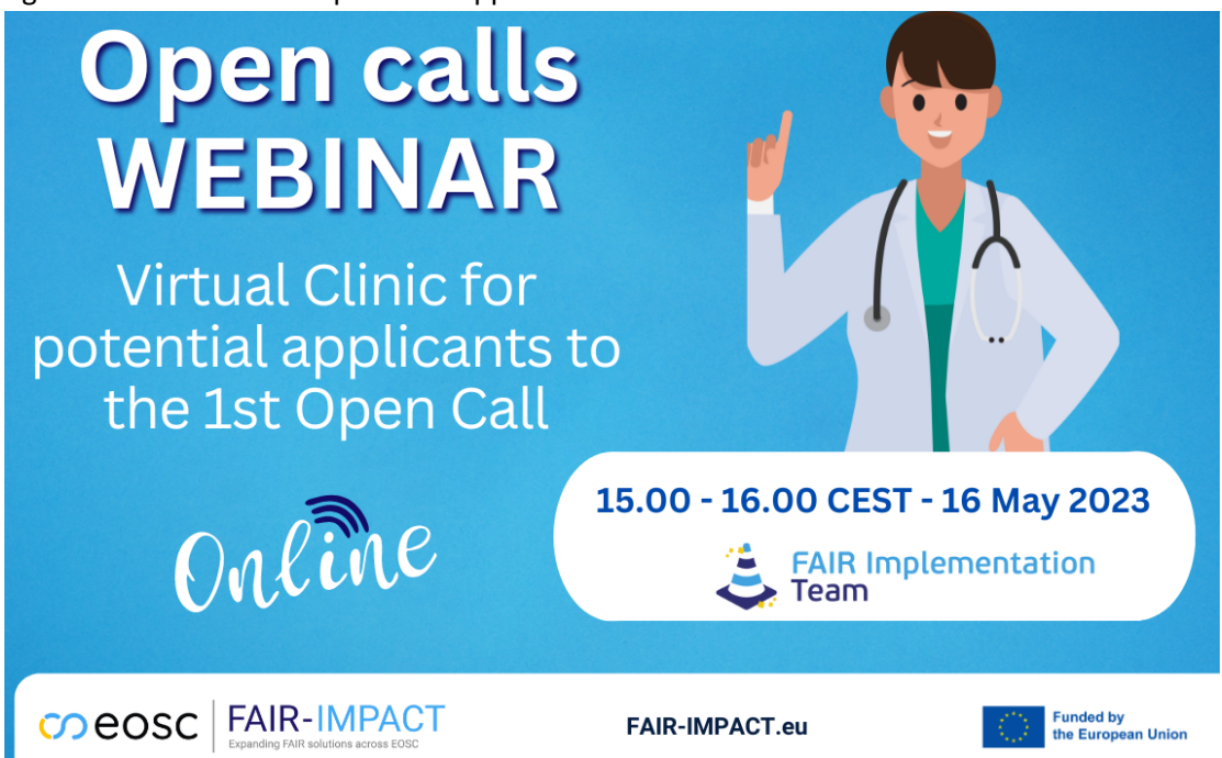
Figure 4. Virtual clinic for potential applicants

Evaluation and selection of successful applicants will be carried out during June and applicants will be informed of the outcome in early July. The support action workshops will kick off in mid September and run to December 2023. The second open call for financial support will be opened at the end of January 2024.