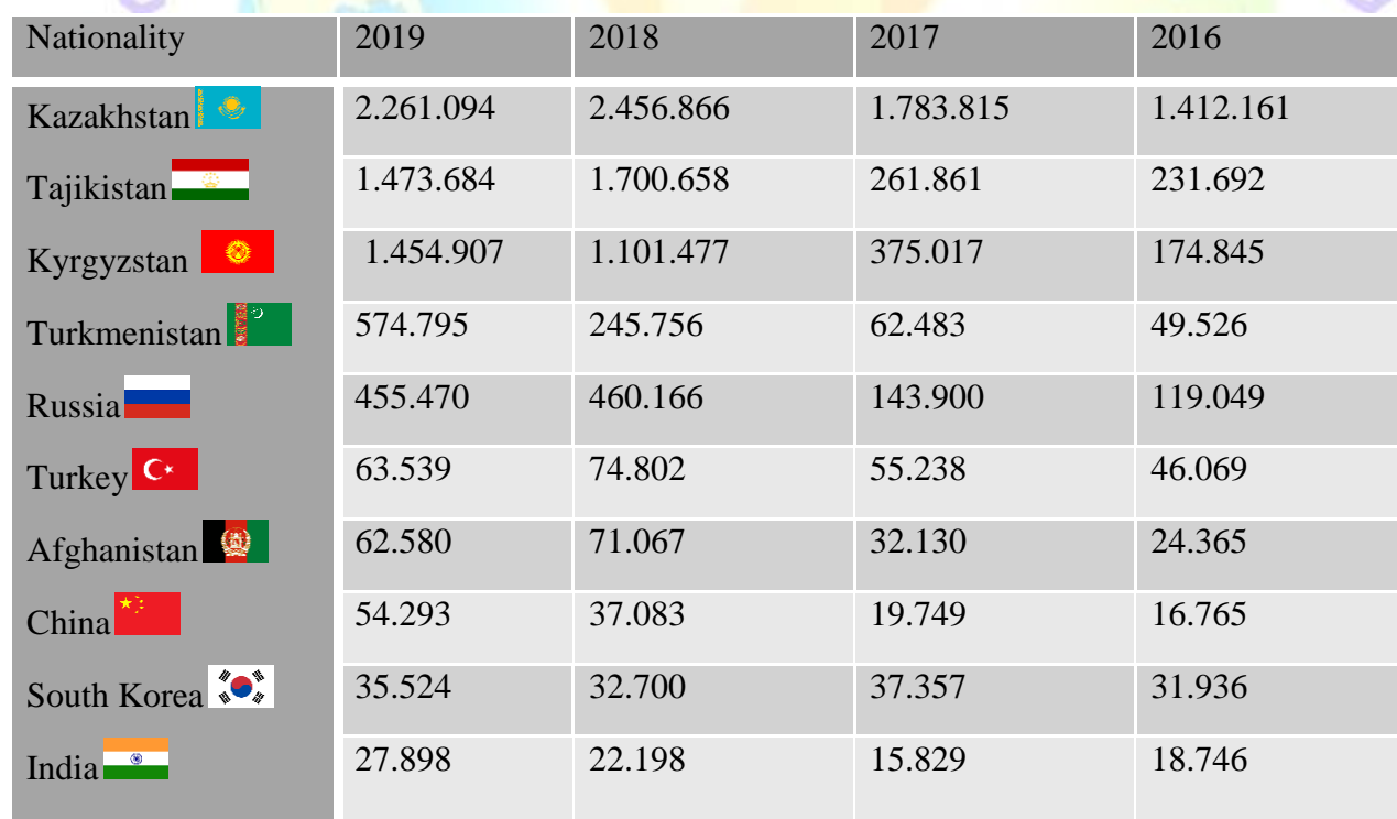
Table 1. Top 10 countries visiting Uzbekistan.

According to the statistics, the followings are the Top 10 countries travelling to Uzbekistan: