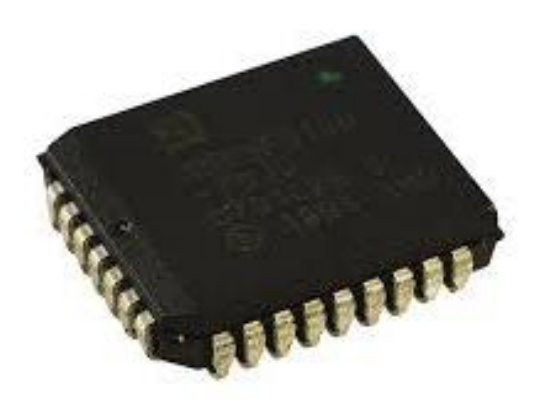
Fig.6:-Example of EPROM [7]

openness to bright light when erasing and via which the silicon chip is visible.