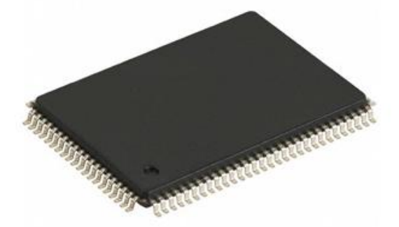
Fig.3:-Example of SRAM [4]

10 ns as opposed to 60 ns for Measure), and because it does not have to halt when it reaches a destination, the length of its action is also significantly shorter. It uses more energy and isn't as thick but is more costly because of this, measure. Because of this, it is typically utilised for saves, whereas Measure is the fundamental breakthrough in semiconductor memory.