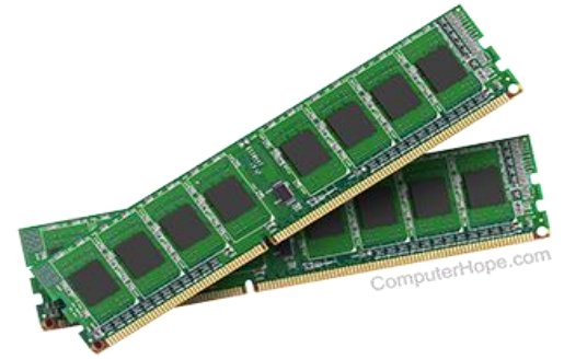
Fig.1:-Example of RAM [2]

memory use it, where components are stored and expected on an ad hoc basis. Information is frequently stored in and reads from this type of memory. To connect the information lines to the tendency to stockpile for reading or composing the section, RAM incorporates multiplexing and demultiplexing circuitry. Typically, a similar region can reach more than the tiniest bit of capacity, and Smash regularly devices have several information bars and are marketed as "8digit" or "16-bit," for example, devices.