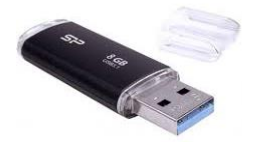
Fig.8:-Example of Flesh Memory [9]

storage sections instead of a full chip. Because a microchip may erase a block of memory cells in a single operation or "flash," this is how the term "flash memory" is derived. Flash memory, however does not support byte-level erasing. Like EPROM, a portable per bit is all that flash memory needs, and a way that it achieves the high density of EPROM (relative to EEPROM).