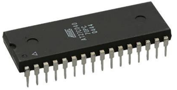
Fig.5:-Example of PROM [6]

The PROM can only be worded once and is non-volatile. An outside source or customer can complete the electrically powered writing operation for the PROM after the initial chip manufacture. To facilitate authoring or programming, specialized equipment is needed. PROMs offer convenience and flexibility. The ROM is still desirable for large-scale production runs. An equivalent to readonly storage is read-mostly storage. This is helpful for applications that require non-volatile media but when reading occurs significantly more frequently than writing.