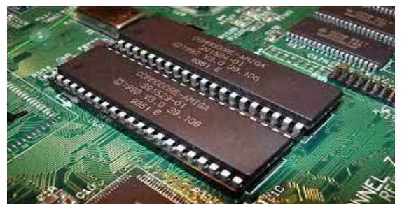
Fig.2:-Example of ROM [3]

Mask-programmable ROMs are only utilised for large-scale manufacture because they are expensive to make in small quantities. Making the data into the ROM at an early stage can require special equipment, depending on the innovation employed in the ROM. Regardless of the method via which the data might typically be changed, this gains the uncommon equipment that is required to destroy the data set up for new data to be written in.