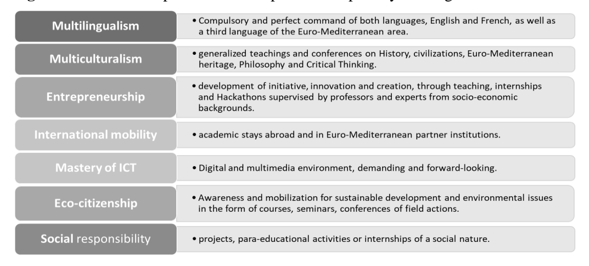
Figure N°4: Euromed profile and its 7 pillars: compulsory training base for all students