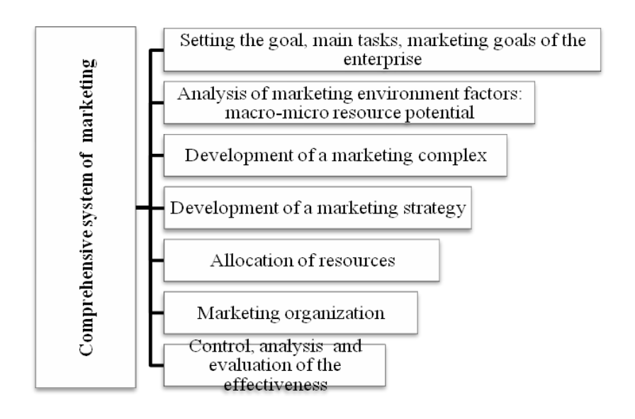
Figure 3.2 Components of the complex system of agrarian marketing of the enterprise

We are convinced that a complex marketing system is a combination of a marketing complex with a marketing management system (Figure 3.2).