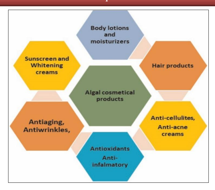
Figure 1: Various formulations of novel delivery systems.

Novel delivery systems in cosmetics include liposomes,[35] nanoparticles,[36] nanospheres,[36] phytosomes,[37] marinosomes,[38] ethosomes,[38] colloidosomes,[38] Niosomes [39] and emulsions.[40] These newer delivery systems carry the active ingredient to the site where it is wanted, thereby increasing efficacy and reducing toxicity or undesirable effects. Most of these novel systems are amphiphilic and support both hydrophilic and lipophilic substances. List of novel formulations in cosmetics and their applications are given in table 2.