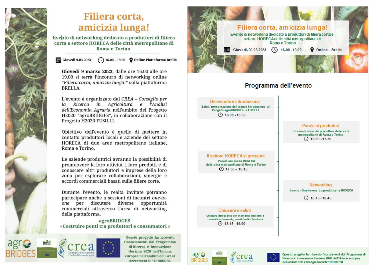
Figure 2: News on CREA web