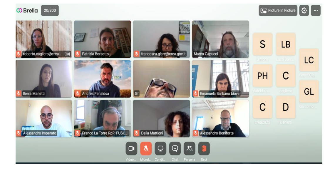
Figure 6: Pictures during the Brella meeting

These sessions were useful for the entire panel to get into the work of participants and also to understand which the most interesting entities were to meet in the matchmaking session.