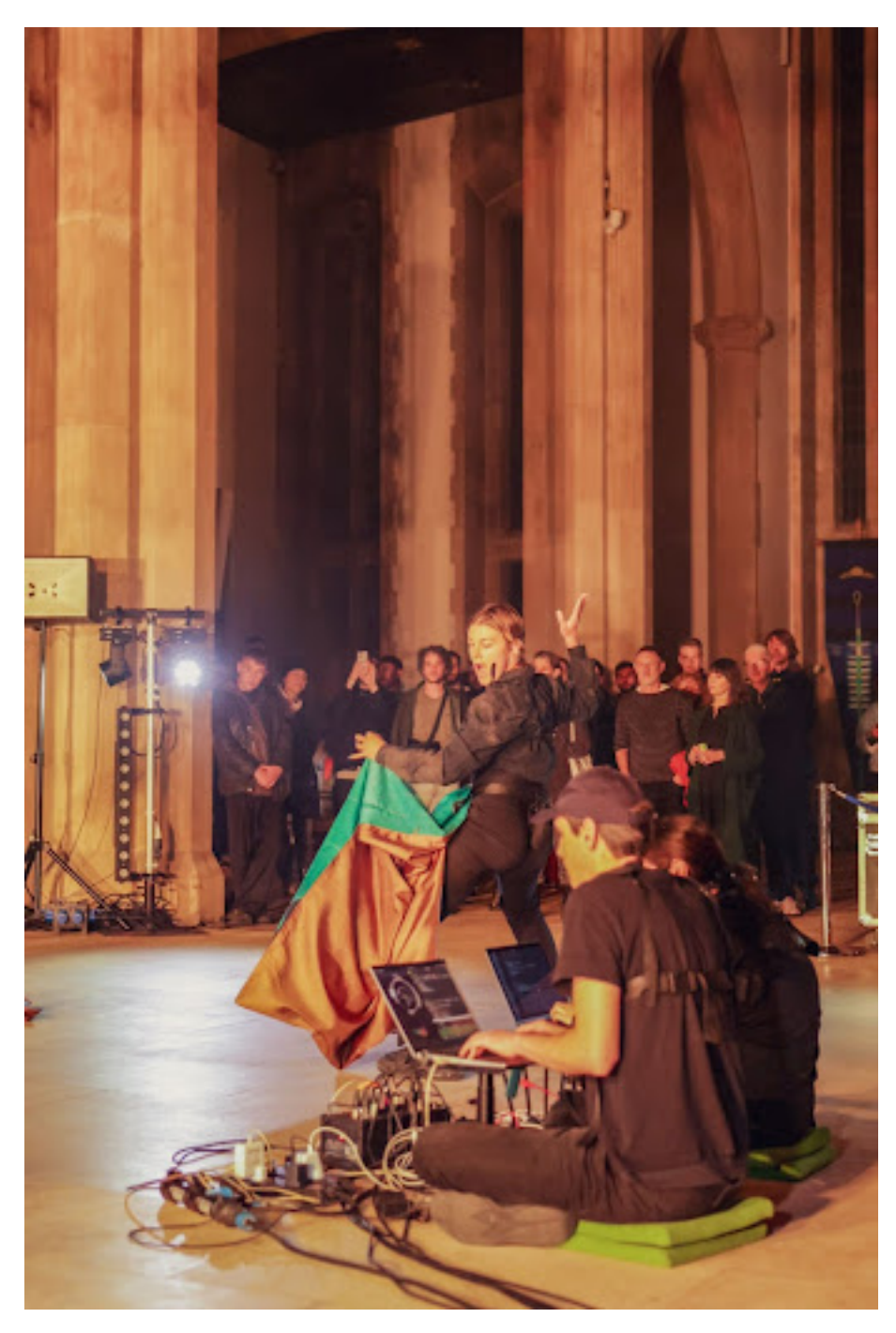
Figure 5: Performance of "Patterns in Between Intelligences" at No Bounds Festival, Sheffield