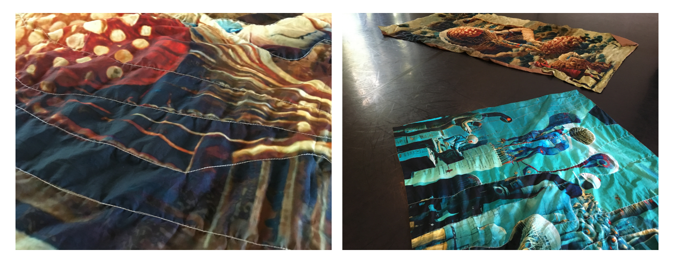
Figure 2: Left: Conductive thread embroidery as capacitive touch sensor on a fabric; Right: Large-scale digital printed fabric with AI generated images

in the end, we found this is not a 'hands-off' process. A human designer needs to create their own interpretations and compositions for these images, through hand-editing and collage, in order to complete it as an artistic piece. In this sense one can say "artificial intelligence" is a powerful creative support tool for us humans to make use of, but it is not creative on its own.