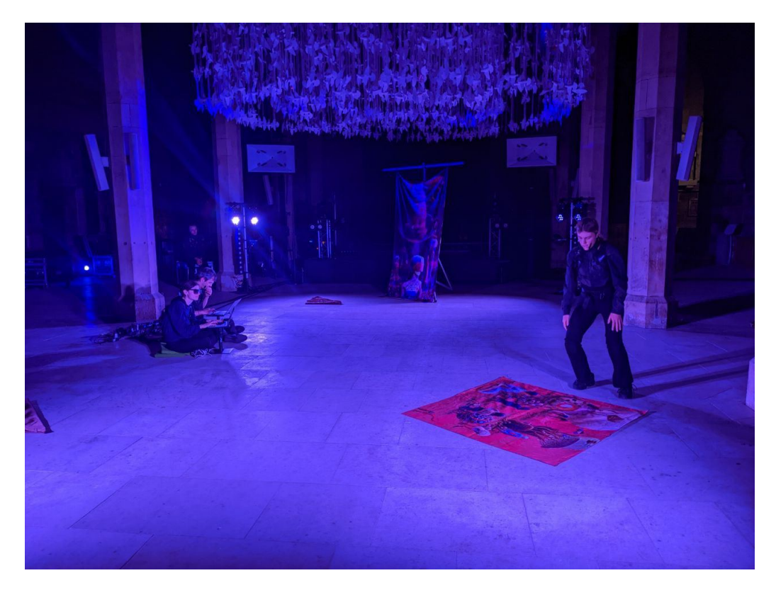
Figure 3: Live coder Lizzie Wilson (left) working with embroidered sensor data interactions with dancer/choreographer Deva Schubert (right)

played back, or adjusting the parameters of an audio effect applied to the pattern. This made the relationship between sound and gesture apparent to the audience. When adjusting some of the parameters, such as the perceptual loudness, it was also useful to logarithmically scale the sensor inputs. An example of this strategy shows how these features were implemented, taking advantage of the ability to reference incoming OSC data by name within Tidal's 'mininotation':