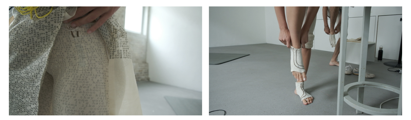
Figure 1: Left: E-Textile pressure sensor embedded in undergarment; Right: E-Textile pressure sensor on socks measuring the foot pressure against the floor. Both are from the early prototype costumes.