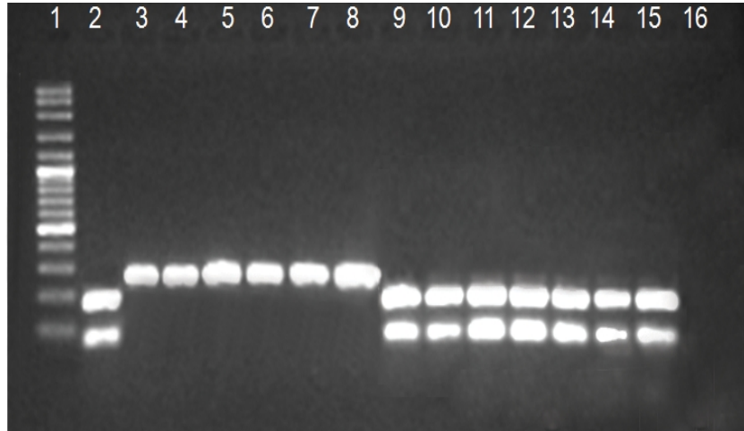
Fig. 2. Results of PCR showing mutations at rpsL codon 43 of M. tuberculosis -STM-resistant strains. lane 1, 100 bp DNA ladder; lane 2, M. tuberculosis H 37 Rv; lanes 3 to 8, strains had mutation at rpsL codon 43; lanes, 9-15 sensitive isolates; lane 16, negative control

A total of 17.6% of the isolates culturally resistant to STM were undigested and proved as STM-resistant carrying mutation at this position (Fig. 2). Comparison between conventional and molecular findings was demonstrated in Table 3.