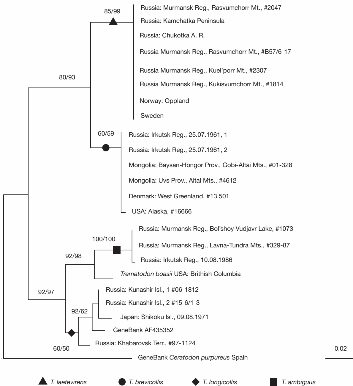
FIG. 2. — Most likely phylogeny inferred from concatenated ITS2 and trnL -F data for species of Trematodon reported from Russia. Bootstrap support values of maximum parsimony and maximum likelihood analyses (MP/ML) higher than 50% are indicated. Scale: substitution per site.

The second subclade (60/59) consisted of six specimens of T. brevicollis from Irkutsk Region, Mongolia, USA and Denmark. The sister group relationships between T. laetevirens and T. brevicollis is moderately to well supported (i.e., 80/93). Three specimens of T. ambiguus from the Murmansk and Irkutsk Regions were located in the third subclade (100/100), T. boasi was placed in the sister relation to it (92/98). Five specimens of T. longicollis composed the fourth subclade (60/50). The clade of T. ambiguus , T. boasi and T. longicollis had support 92/97.