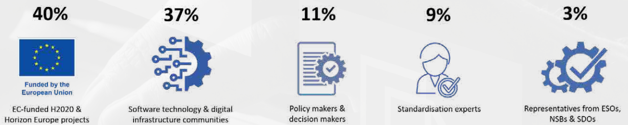
Figure 2: Attendees by groups