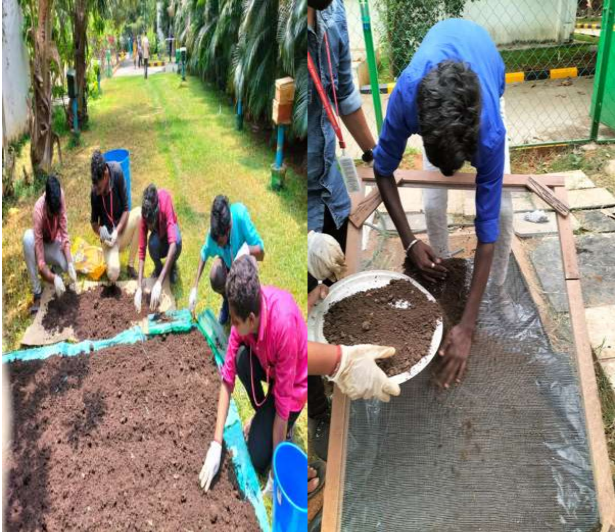
Drying and sieving of compost