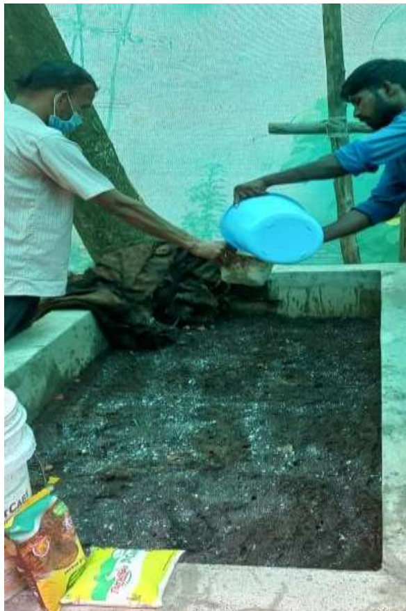
Sprinkling of curd with country sugar solution