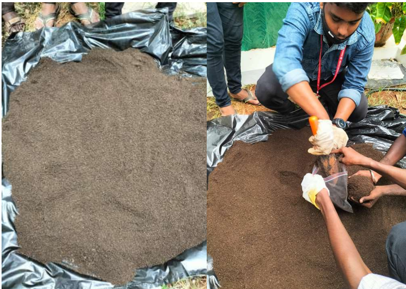
Heaping and Packing of vermicompost

Table.1 clearly shows that the pH decreases from 8.4 to 7.49 at 25°C on the 30th day of vermicomposting period (from 0 to 30 days). The pH of the vermicomposting was 7.49% after 55 days, with a C: N ratio of 11.7%, Nitrogen (N) was 0.63%, Phosphorus (P) 90mg/kg, Potassium (K) 308 mg/kg, and moisture was BDL (DL)0.2%, Lead (L)-BDL (DL)-4.0mg/kg, and Cadmium (C) BDL (DL)-2.0mg/kg.