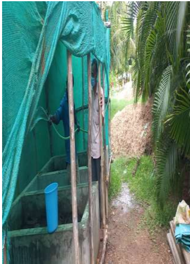
watering the Vermicomposting Beds

During the composting process, the compost materials were tested for physicochemical parameters such as pH, humidity, total Nitrogen, available Phosphorus, exchangeable potassium, heavy metals such as lead, cadmium, copper, and others (Piper, 1996; Jackson, 1973; Ishwaran and Marwaha, 1980), as well as earthworm number, cocoon production, and organic substrate weight loss (Tripathi, and Bharadwaj, 2004; Wantanabe and Tsukamoto 1976).