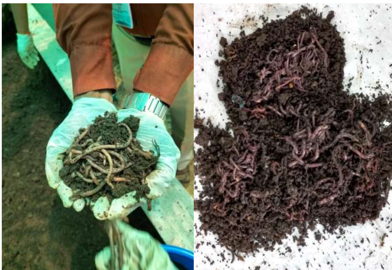
Compost with worms

Earthworm biomass increased in all beds due to their hermaphrodite habit, and body weight and length increased in the same beds due to nutrient-rich raw materials in the vermi beds. Fifty earthworms were collected from each bed and their body weight and length were measured in the lab. Because bed-I and bed-II have been filled with cow dung and agro wastes, which are easily digestible and decomposable, the body weight of earthworms increases more in bed-I-22.926 gm than in bed-II-20.270gm and bed-III-10.916gm, and thus the compost induces the body weight shown in the table:5