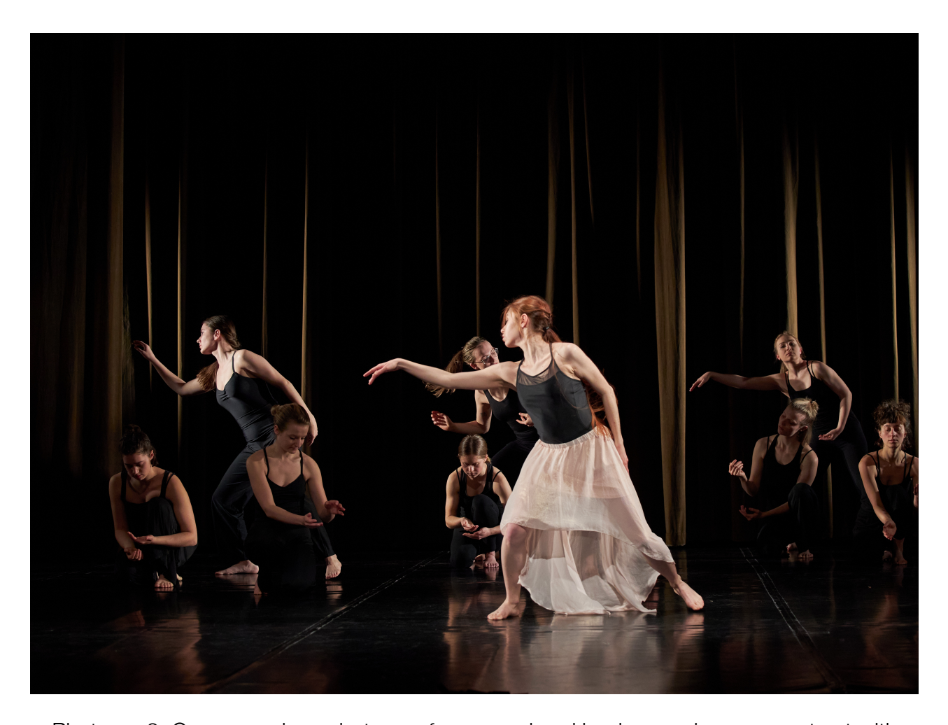
Photo no 2. Correspondence between foreground and background versus contrast with the middle group.

In this Part One worked in the way I use the most often - combining my experience in the eurhythmics with dance and theater. In the warm-up I introduce some elements, later crucial for the motoric coordination in the improvisation phase aimed to generate adequate movement material expected to be achieve.