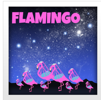
Figure 1. Preliminary logo design for the FLAMINGO collaboration.

The vision system of flamingos is optimized for their feeding behavior adopted to filter-feeding, which allows them to detect and feed on very small particles (Lisney et al. 2020; Mascitti & Kravetz 2002). Cherenkov telescopes are optimized for detecting faint flashes of light produced by high-energy cosmic rays and gamma rays as they interact with the Earth's atmosphere. These flashes are extremely brief and difficult to detect, requiring highly sensitive telescopes with advanced camera systems. In addition, the visual sensitivity of birds, compared to humans, reaches lower wavelengths into the near-ultraviolet band (Matthew 2017), which is the dominant band to detect Cherenkov light.