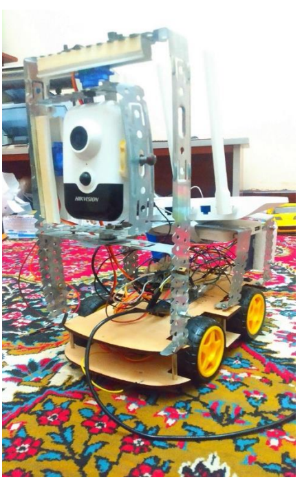
Figure 2. External view of VR mobile robot

The camera rotates according to the head movement of the person wearing the virtual glasses. This project has many uses. This robot is easy to control from a distance. Therefore, the VR mobile robot can be used in these places, whatever work needs to be done at a distance. For example, inspecting pipes underground, in low-oxygen areas, entering and monitoring thin and narrow places, working in dangerous places [4], etc. The developed VR mobile robot is depicted in figure 2.