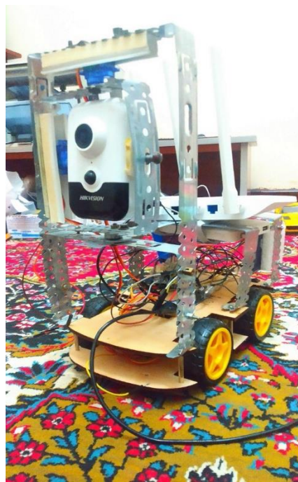
Figure 2. External view of VR mobile robot

The camera rotates according to the head movement of the person wearing the virtual glasses. This project has many uses. This robot is easy to control from a distance. Therefore, the VR mobile robot can be used in these places, whatever work needs to be done at a distance. For example, inspecting pipes underground, in low-oxygen areas, entering and monitoring thin and narrow places, working in dangerous places [4], etc. The developed VR mobile robot is depicted in figure 2.