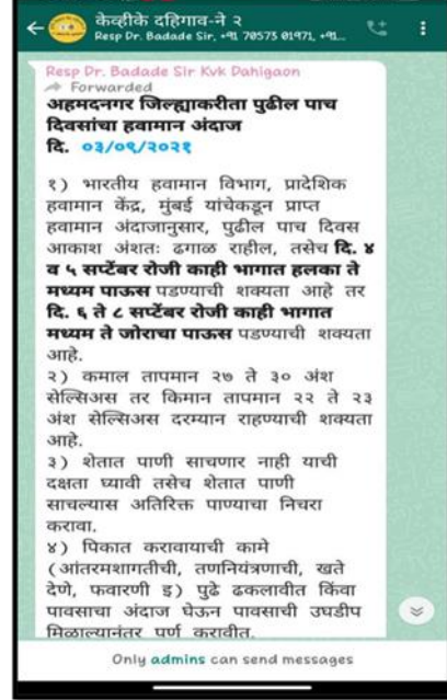
Information regarding agricultural technology shared on WhatsApp Groups