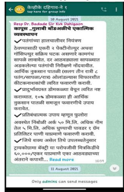
Information regarding agricultural technology shared on WhatsApp Groups