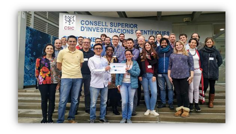
Image 5: From Cos4Cloud's kick-off meeting (November 2019).

since in the implementation team experts from the field of CS, service designers, companies, researches and scientists all join forces.