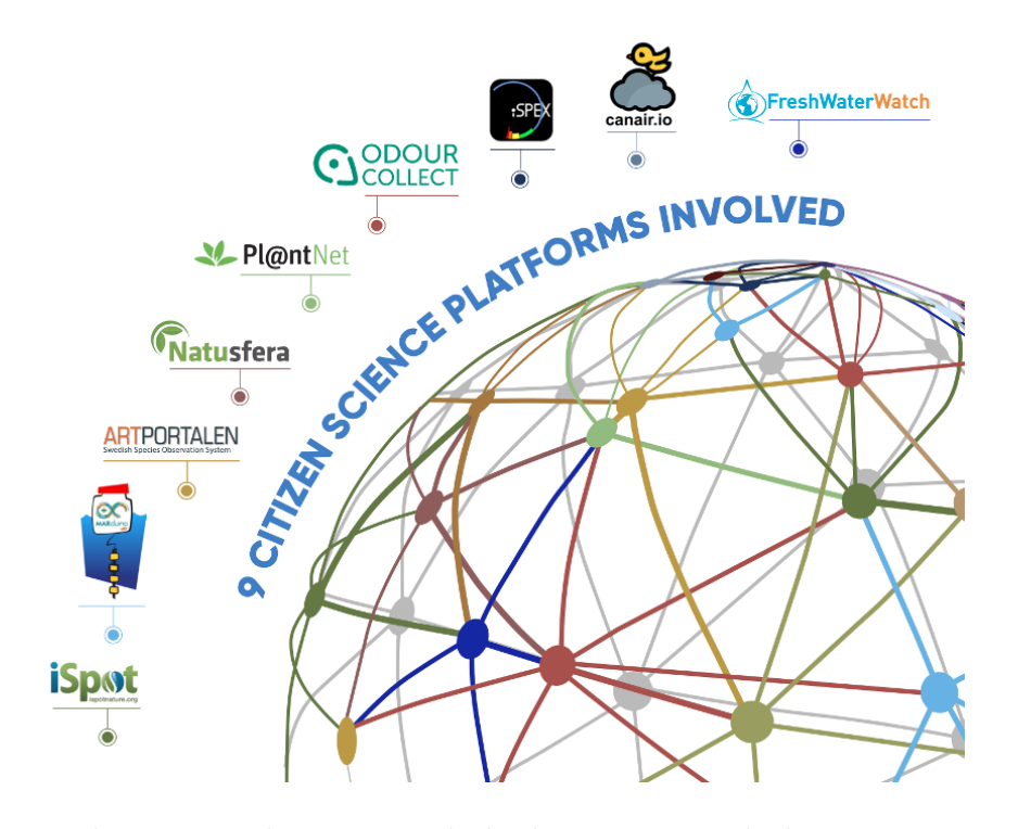
Image 6: The nine citizen observatories involved in the European Cos4Cloud project

Examples of 4 of the COs participating in the project are given below: biodiversity observatories iSpot , Natusfera and PlantNet and environmental monitoring observatory OdourCollect .