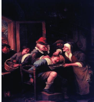
Figure 3- The extraction of the stone of madness' or 'Cure of the Folly', painted circa 1670 by Jan Steen (1626-1679). (Rotterdam: Museum Boymans-Van Beuningen).