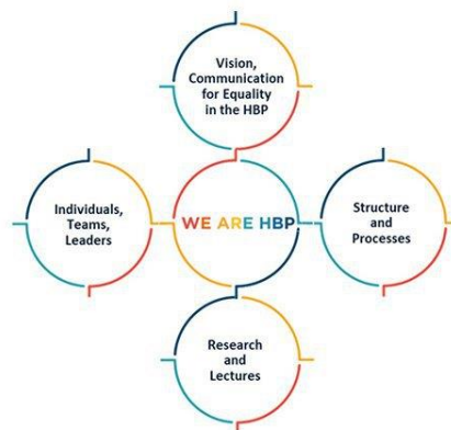
Figure 2 – Illustration of the GAP in the HBP