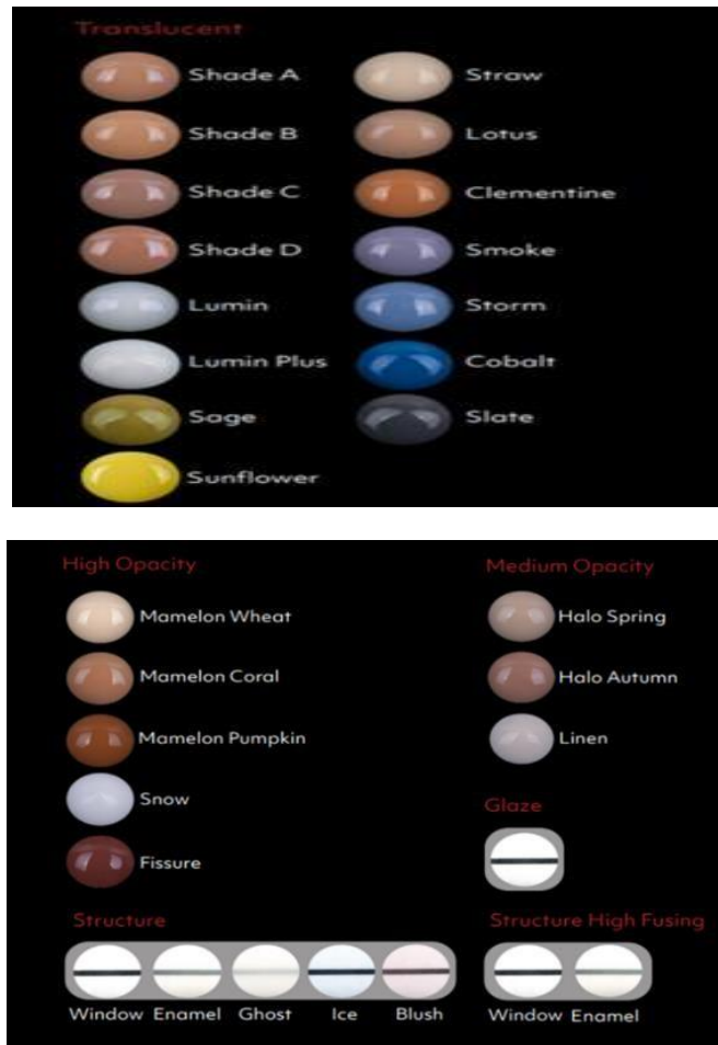
Fig 2: - MiYO system for teeth 4