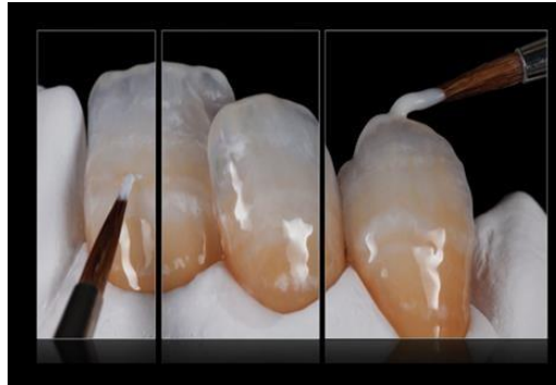
Fig1:- Application of MiYO liquid ceramic 3

Recently an innovative self-glazing liquid ceramic (MiYO, Jensen Dental) was developed as an alternative to layered ceramics to improve the esthetics of monolithic CAD/CAM or pressed-ceramic restorations. 3 Based on glazing material, this liquid ceramic allows tooth shade and shape modifications, accentuated character, and customization while simultaneously enhancing the surface texture of the monolithic restoration. The liquid ceramic creates an ultrathin ceramic layer that eliminates the need for framework cut back. This is an important factor, since the strength of the ceramics will not be modified through cut back techniques. 3,4 All staining and customization can be done down to 0.1 to 0.2 mm on the ceramic surface. Different color schemes with translucent, semi-translucent, and opaque self-glazing colors were created to improve the color, shade, and shape of zirconia-based and lithium disilicate ceramics.