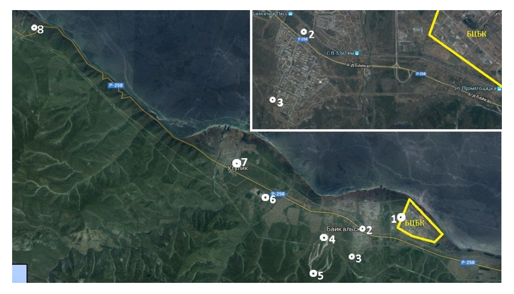
Figure 2. Sampling sites of the cedar needles: 1 – BPPM industrial zone; 2 – Baykalsk, the area between the railway and the park; 3 - Baykalsk, Yuzhny district, residential area; 4 - Mount Sobolinaya (foot); 5 - Mount Sobolinaya (peak); 6 - Overgrown with vegetation waste collection BPPM; 7 - Utulikskaya dacha; 8 - Areas for the reproduction of seeds of forest species.

The non-destructive method of X-ray fluorescence analysis for plants has been developed at the Institute of Geochemistry of the Siberian Branch of the Russian Academy of Sciences (Irkutsk, Russia) (Chuparina and Martynov 2011). It does not require the processing of samples by chemical substances and temperature. Finely ground plant sample material (less than 100 microns) is pressed into a tablet emitter on a boric acid substrate. The needles sample mass is 1 g. The sulfur content in the needles is determined by X-ray fluorescence analysis on an S4 Pioneer wave spectrophotometer (Bruker AXS, Germany). The error characterizing the convergence of the results of X-ray fluorescence analysis does not exceed 5% rel.