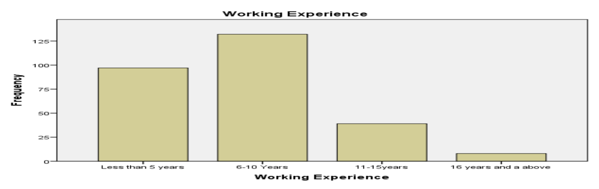
Fig 4.2 Working experience of the respondent

As it summarized in the above table 35.1 % of the respondents have less than 5 years of work experience, 47.8 % have6-10 years of experience, 14.1% of the respondents have 11-15 years of working experience and2.9 % have16 years and above work experience. Generally, they had enough experience in the institution. Therefore, they were appreciating the essential of the study and the respondents had a reasonable experience in their job which enables them to evaluate the procurement performance in the institution.