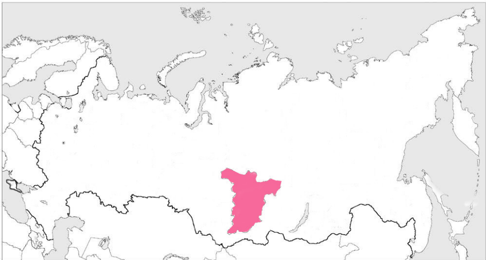
Figure 1. The placement of Khakassia and South of Krasnoyarsk region in Russian Federation, in according to the boundaries marked in the Catalogue of Lepidoptera of Russia (2019).