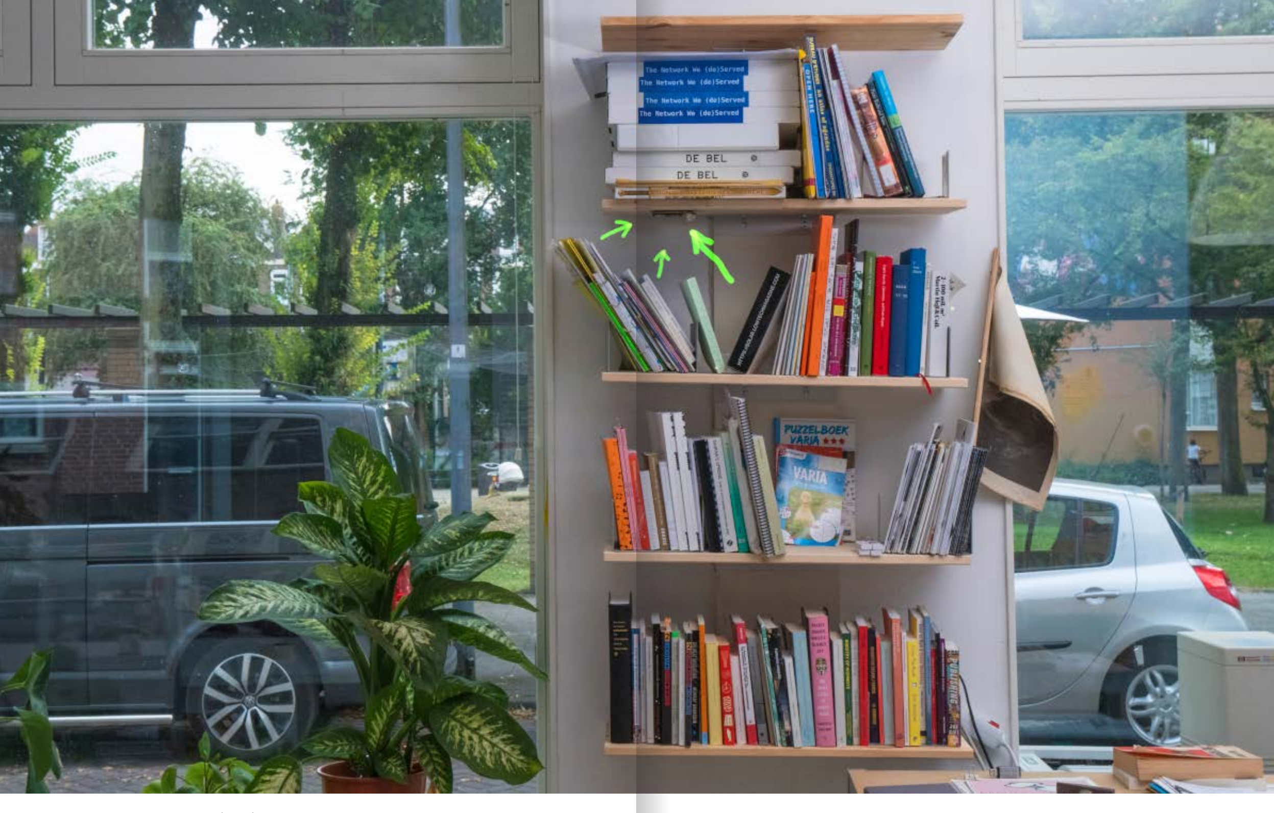
Figure 4: Varia collective. (2016-). Bibliotecha Varia . Retrieved from <a href="https://networksofonesown.varia.zone/Bibliotecha/">https://networksofonesown.varia.zone/Bibliotecha/</a>. In Rotterdam, artists, media students and theorists formed around the Varia space placed an unusual electronic book into their bookshelve. Bibliotecha proposes an alternative model of distribution for digital texts. It allows specific communities to form and share their collections, through a single-board computer running free software to share books over a local WIFI hotspot. No server farm required.