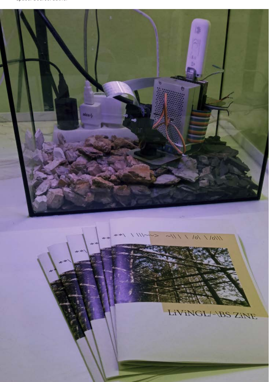
Figure 3: Klodner, M. et al. (2020-). Leaf node9 . Retrieved from <a href="https://webs.node9.org/channel/leaf">https://webs.node9.org/channel/leaf</a>. Solar-power designed field server for forest livinglab exhibited with Livinglabs zine in Entrance Gallery in Prague. Ecosystems and biodiversity are computationally supported with sensitivity to local resources, measured by environmental sensors. Leaf's open social network node and camera intermediate environmental art experiments from the field research or gallery space.

again and again. However, RSS does not allow for comments, sharing, or interaction, which is why events and their actors were included as an extension. Evan Podromou continued his work on various social projects and is a co-author of ActivityStreams,<sup>5</sup> a major open format specification for activity protocols, which are used to syndicate activities taken in social web applications and services, already widely used by websites, and decentralized social media hubs, creating a network known as the Fediverse. (Monoskop, 2022)