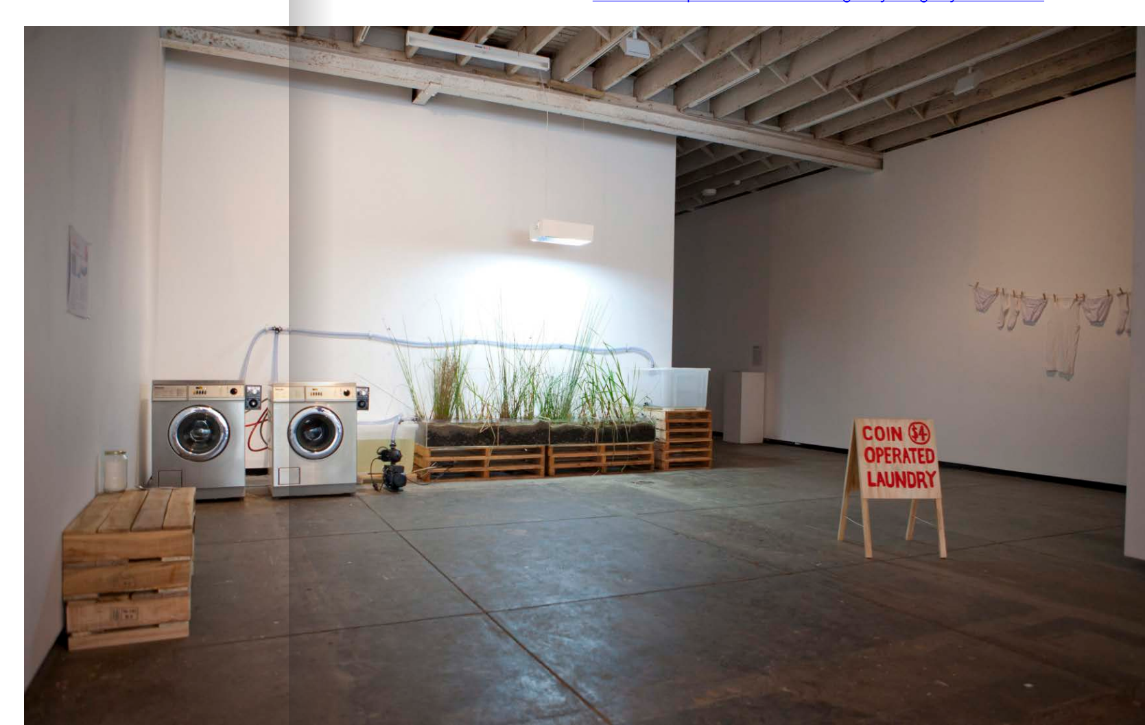
Figure 2: Brain, T. (2011, 2021). Coin-Operated Wetland. Retrieved from http://tegabrain.com/Coin-Operated-Wetland. Recreates natural water purification circuit in a gallery. Image by Alex Davies.

We can compare one of the original works of Hans Haacke with a contemporary example to underline analogies between the systems art of 1970s and the present. Hans Haacke's Rhine-Water Purification Plant (1972) at the Krefeld Museum, included a device for purifying water from the Rhine with functional chemical treatment and water filtration using activated carbon and sand. The purified water was pumped into a large transparent acrylic tank with swimming goldfish to demonstrate how it is possible to construct a life-supporting system technologically. However, the project also intervened behind the cosmetic patch of restorative eco-aesthetics. Haacke documented the extent of the pollution of the wastewater discharged into the Rhine in Krefeld, which amounted to 42 million cubic meters each year, and quantified the volume and types of industrial and domestic waste, listing the main polluters. The project addressed the need to restore the degraded ecosystem and pointed out the city's role in pollution, which attracted attention from the local media He called the political effect of this work "a real-time social system". (Demos, 2016, p. 47)