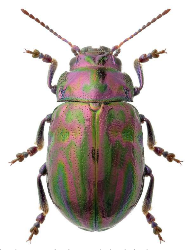
Figure 2. Ambrostoma superbum from Novosibirsk, male, dorsal view.

Distribution. Southeast of Western Siberia (Fig. 1), South of Eastern Siberia and the Russian Far East, Mongolia, China (including Taiwan), and Korea.