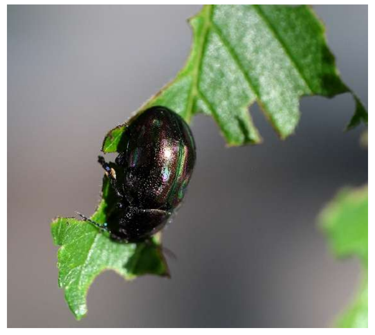
Figure 4. Ambrostoma superbum on a leaf of Ulmus pumila .