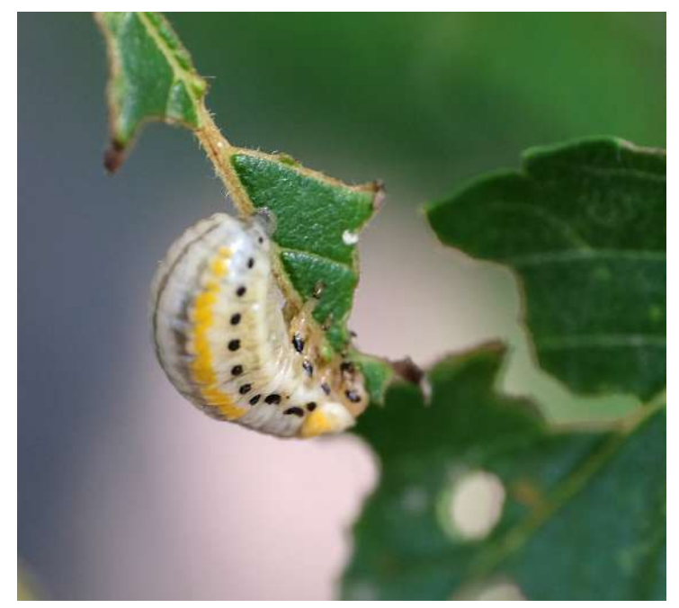
Figure 5. Larva of Ambrostoma superbum on a leaf of Ulmus pumila .