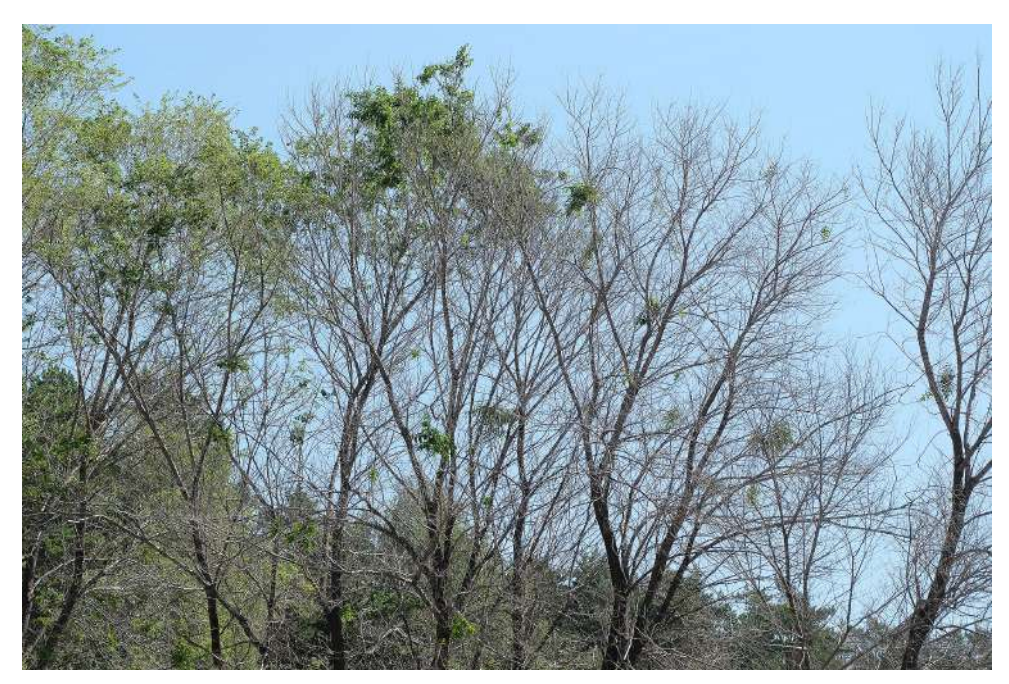
Figure 3. Trees ( Ulmus pumila ) damaged by Ambrostoma superbum from Lesosechnaya str.