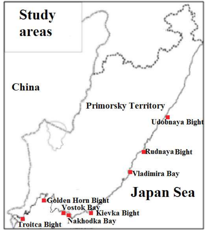
Figure 1. Sampling sites.