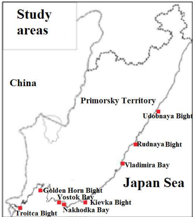
Figure 1. Sampling sites.