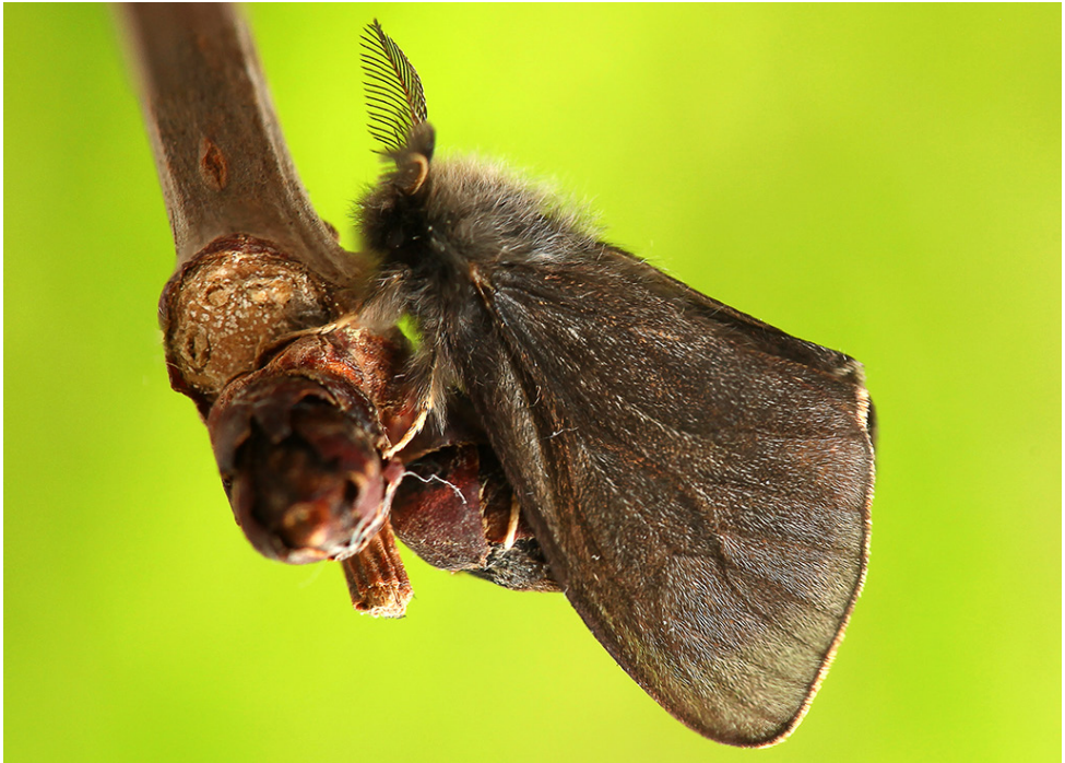
Figure 9. Canephora hirsuta , Davydovka, ex larva, 8.VI.2014, photo by S.A. Knyazev.