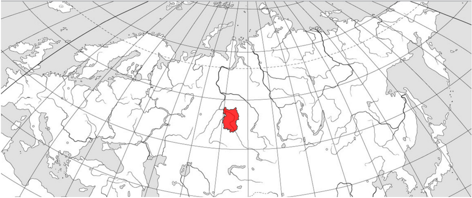
Figure 1. Location of the Omsk Region in Northern Eurasia.

Gelechiidae (Ponomarenko and Knyazev 2020), Tortricidae (Dubatolov et al. 2010; Knyazev and Dubatolov 2019), Galactiidae (Knyazev et al. 2016), Pterophoridae (Knyazev and Ustjuzhanin 2013; Knyazev et al. 2018, 2019), Thyrididae (Knyazev et al. 2016), Crambidae (Knyazev et al. 2014, 2016, 2018, 2019, 2021; Knyazev and Ponomaryov 2019) and Pyralidae (Knyazev et al. 2014, 2018, 2019). In the end of 2021 a large work on 27 families of Microlepidoptera was published (Sinev and Knyazev 2021).