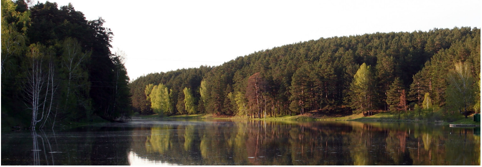
Figure 4. Pine Forest in the forest zone, Muromtsevsky district, Petropavlovka vill. vicinity, 26.V.2009.