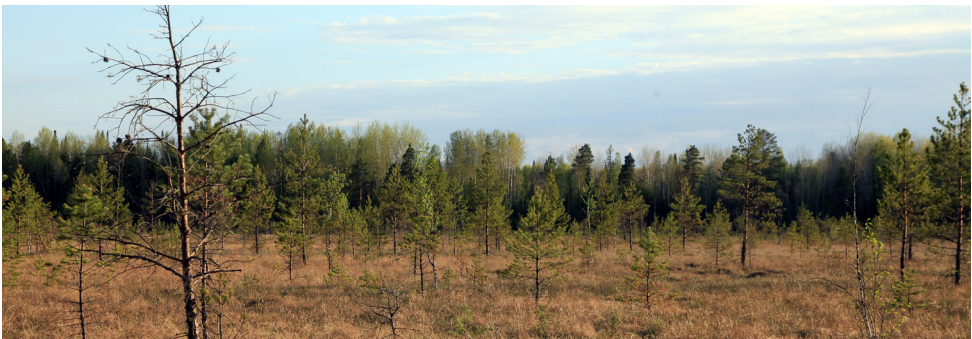
Figure 3. Sphagnum swamp in the North-West of the forest zone, Ust-Ishimskiy district, 5,5 km NW of Ust-Ishim vill., 7.VI.2018, photo by S.A. Knyazev.