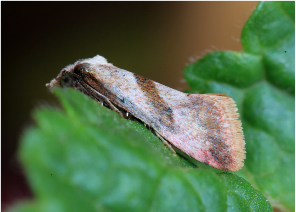
Figure 19. Falseuncaria degreyana , Buzan, 1.VI.2018, photo by S.A. Knyazev.