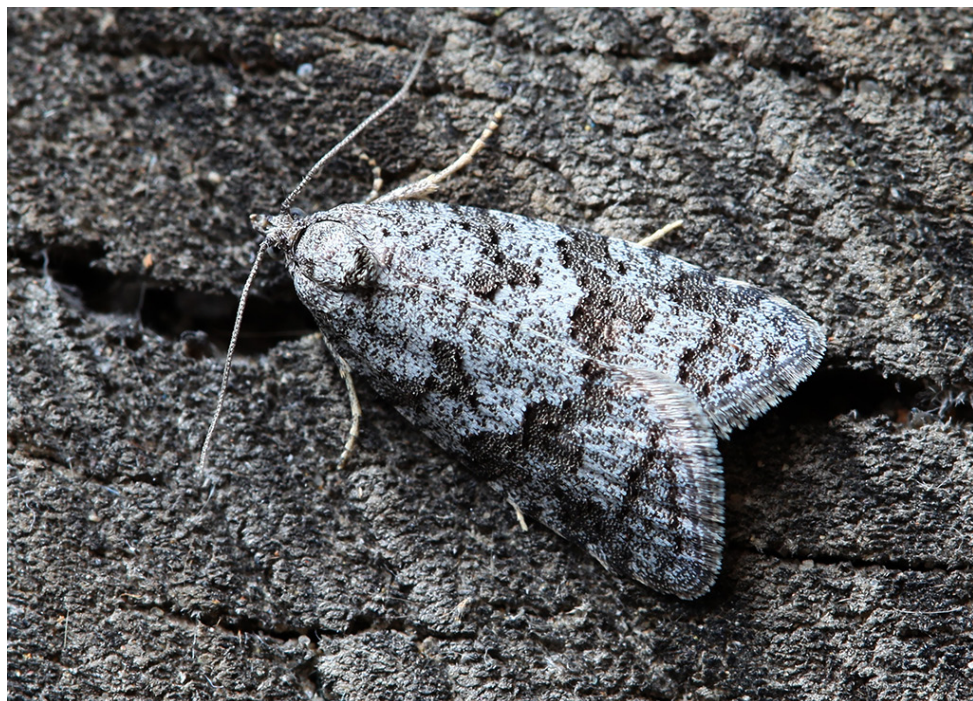
Figure 20. Cnephasia alticolana , Krasnyi Oktyabr', ex larva, 3.XI.2020, S.M. Saikina leg., photo by S.A. Knyazev.