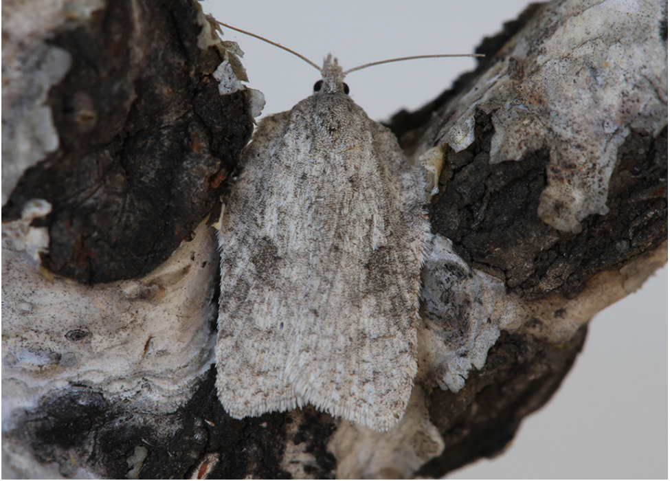
Figure 18. Acleris roscidana , Yakovlevka, 20.V.2018, photo by S.A. Knyazev.