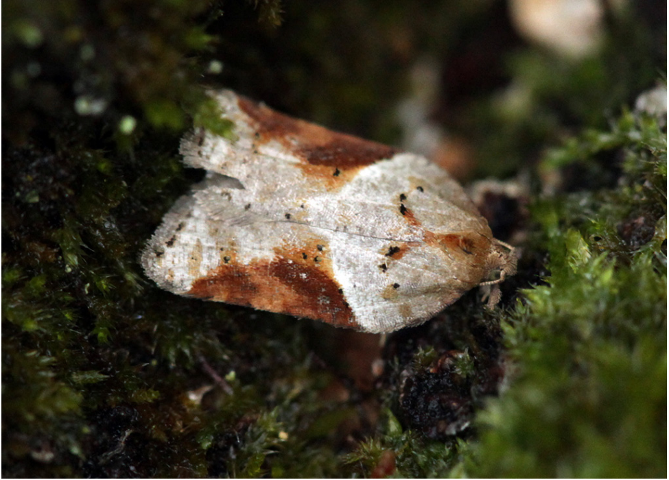
Figure 16. Acleris laterana , Petropavlovka, 6.IX.2018, photo by S.A. Knyazev.