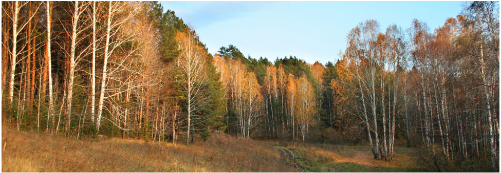
Figure 5. Mixed forest in the forest zone, Petropavlovka vill. vicinity, 4.X.2008, photo by S.A. Knyazev.