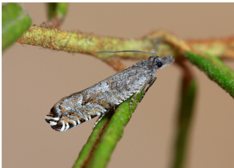
Figure 21. Ancylis unguicella , Gulyai Pole, 16.VI.2018, photo by S.A. Knyazev.