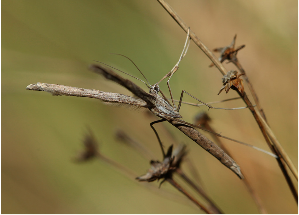
Figure 15. Agdistis intermedia , Ataichye, 23.VI.2014, photo by S.A. Knyazev.