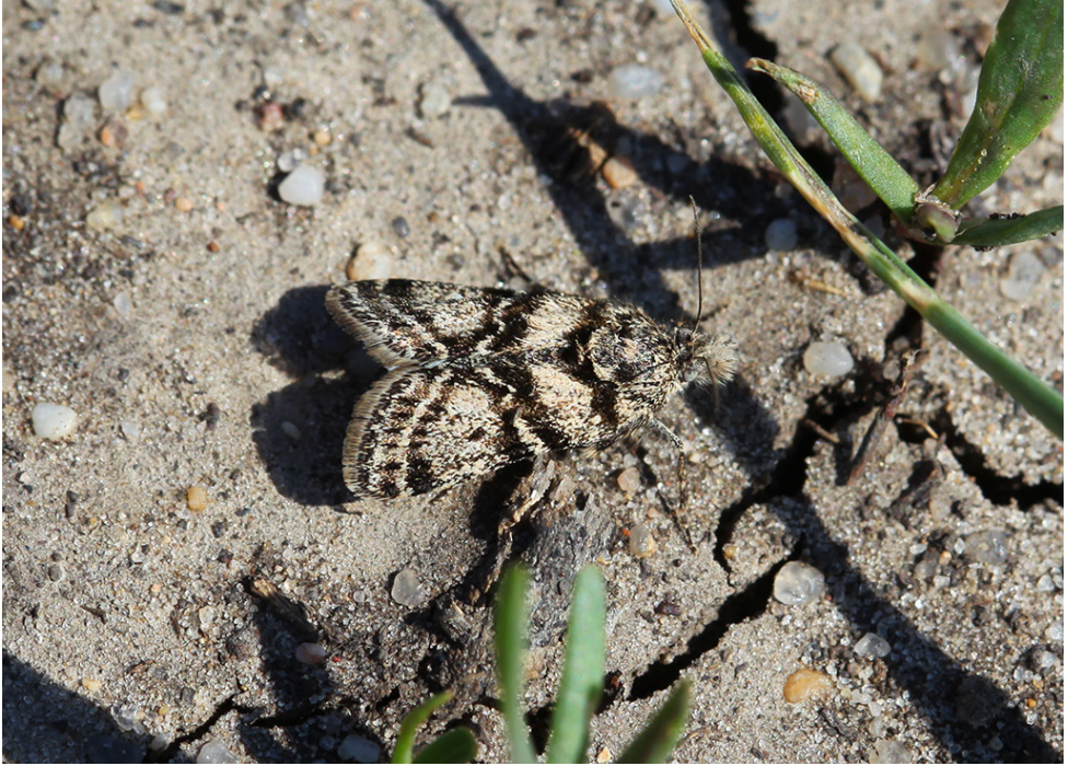
Figure 24. Pogonotrophus allotriella , Buzan, 26.IV.2020, photo by S.A. Knyazev.