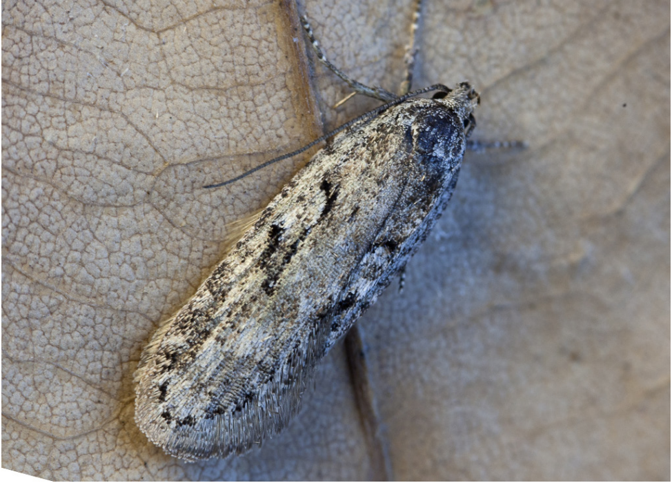
Figure 13. Exaeretia ciniflonella , Yakovlevka, overwintering moth under the tree bark, 19.I.2018, photo by S.A. Knyazev.