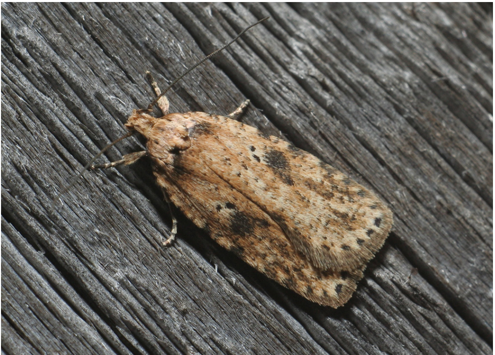
Figure 14. Agonopterix arenella , Petropavlovka, 4.X.2008, photo by S.A. Knyazev.