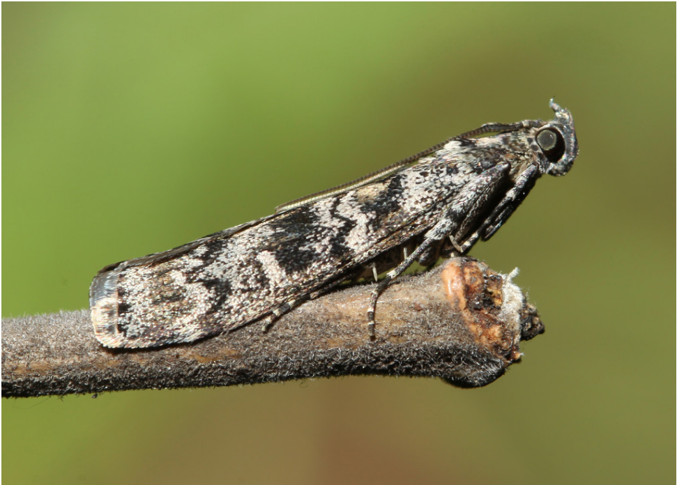
Figure 23. Dioryctria abietella , Podgorodka, 10.VI.2014, photo by S.A. Knyazev.