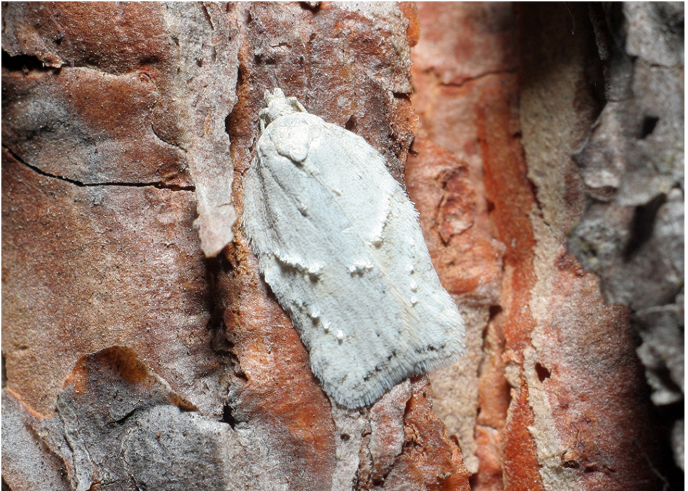
Figure 17. Acleris logiana , Petropavlovka, 4.X.2008, photo by S.A. Knyazev.