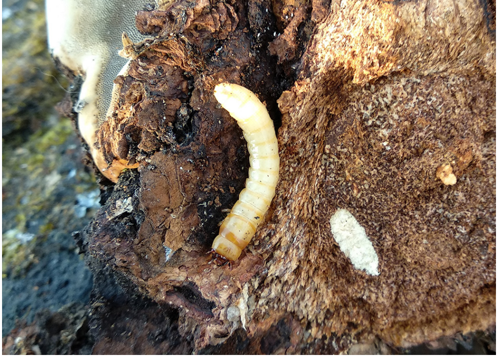
Figure 10. Scardia boletella , larva, Davydovka, 11.IV.2020, photo by S.A. Knyazev.