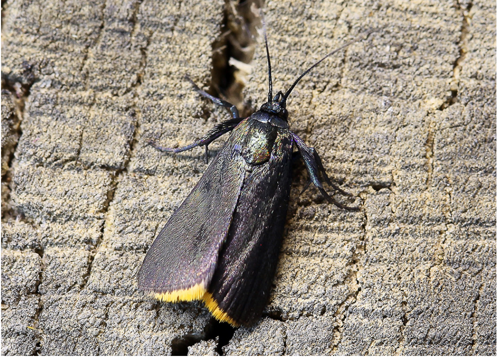
Figure 22. Catastia marginea , Khlebodarovka, 5.VI.2021, photo by S.A. Knyazev.