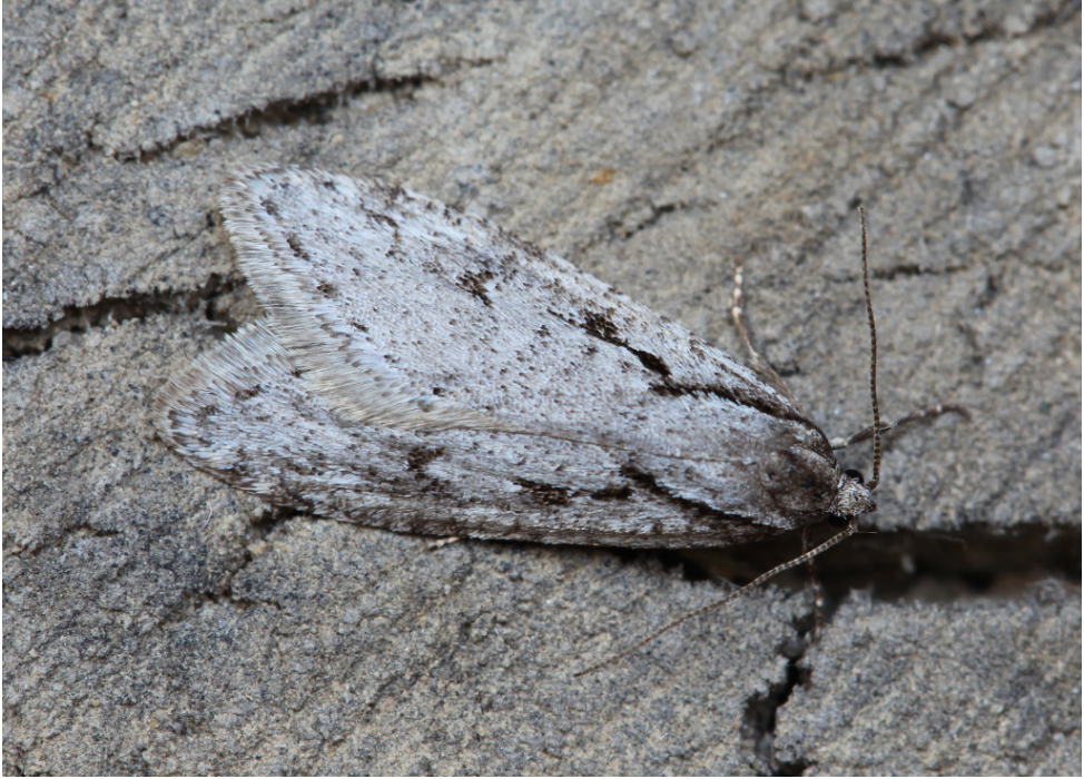
Figure 11. Semioscopsis avellanella , Davydovka, 11.IV.2020, photo by S.A. Knyazev.