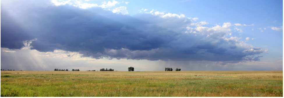
Figure 8. Steppe on the South of Omsk Region, Russko-Polyansky district, 2 km SE of Buzan vill., 22.VI.2018, photo by S.A. Knyazev.