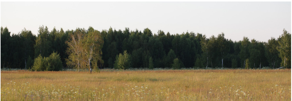
Figure 6. Meadow near the Birch forest in the forest-steppe zone, Nazyvaevsky district, 2,5 km NW Nalimovo vill., 20.VII.2019, photo by S.A. Knyazev.