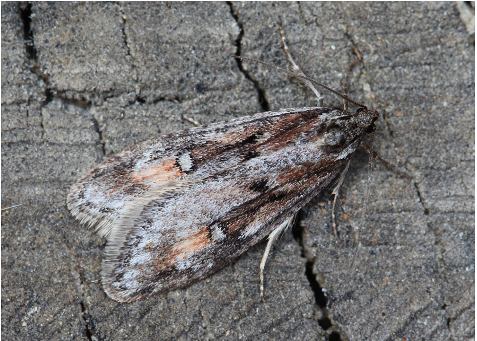
Figure 12. Semioscopsis oculella , Davydovka, 11.IV.2020, photo by S.A. Knyazev.