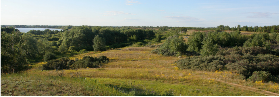
Figure 7. Floodplain of the Irtysh river on the South of the forest-steppe zone, Cherlaksy district, 2 km N of Malyi Atmas vill., 7.VII.2011, photo by S.A. Knyazev.