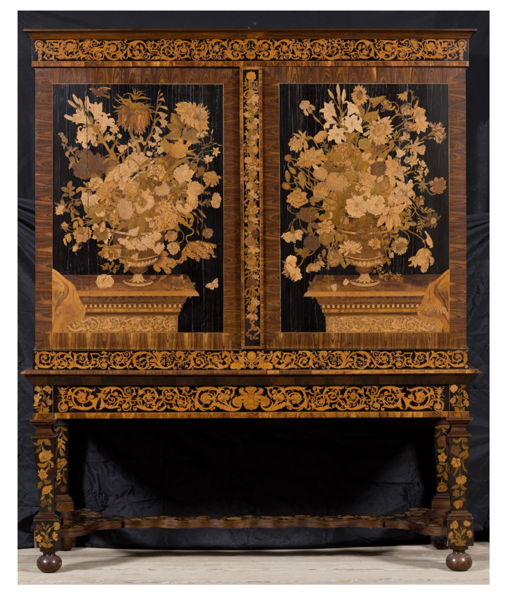
Figure 1. Van Mekeren cabinet situated to the left-hand side of the door of the Grand Salon at Amerongen Castle.

Jan van Mekeren (Tiel, ca. 1658 – Amsterdam 1733) is the only late-17th century cabinetmaker to which specific pieces of furniture can be firmly attributed. Amerongen Castle in the Netherlands, displays two of these cabinets in the Grand Salon, located on both sides of the entrance door. The cabinet placed on the left-hand side of the door is the object of this study. This is the only known cabinet by Van Mekeren that combines the large floral marquetry of the doors with scrolls on the drawer front of the stand and around the bottom and frieze of the cabinet (Fig. 1). The aim of the research was to establish the date and provenance of the wood, to determine the potential production time of the cabinet.